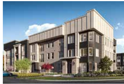
The Rey on Reynolds 286 Units Atlanta, GA