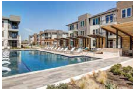
The Conley 259 Units Austin, TX