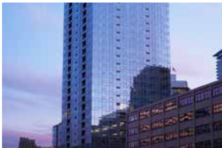
Aspira 325 units Seattle, WA