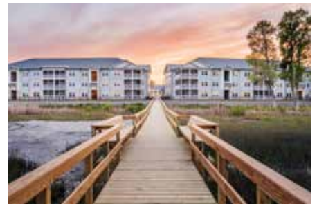
Waterleaf at Battery Creek 212 Units Beaufort, SC