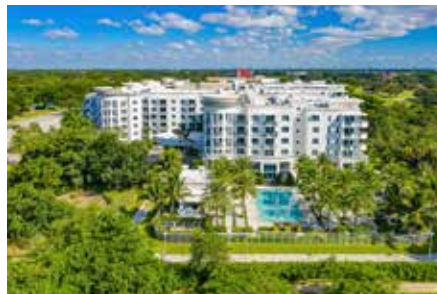
Altis Boca 398 Units Boca Raton, FL