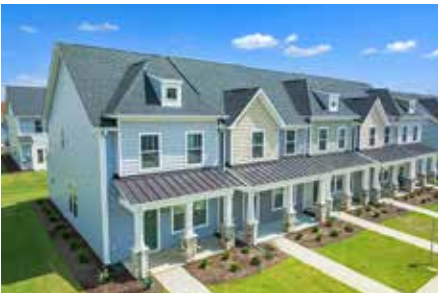
Artisan Living Green Creek 85 Townhomes Boiling Springs, SC