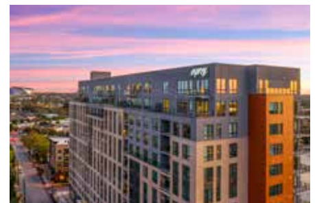
Osprey 320 Units Atlanta, GA