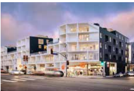
The Boulevard on Santa Monica 337 Units West Los Angeles, CA