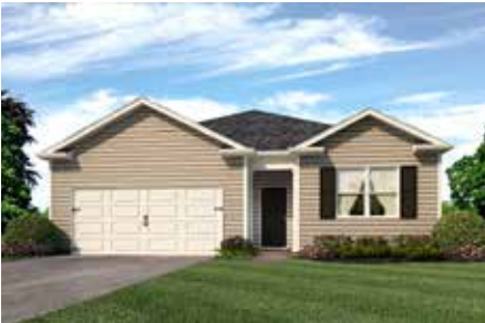
Rock Ridge Estates 69 Single-Family Homes Pensacola, FL