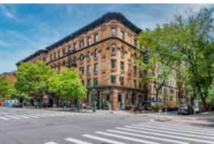
AIMCO Portfolio 360 Units New York, NY