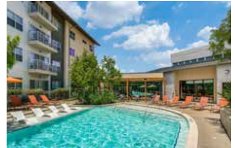
Yorktown 226 units Dallas, TX