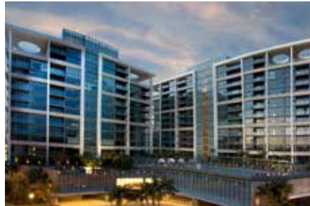
Astoria at Central Park West 240 units Irvine, CA