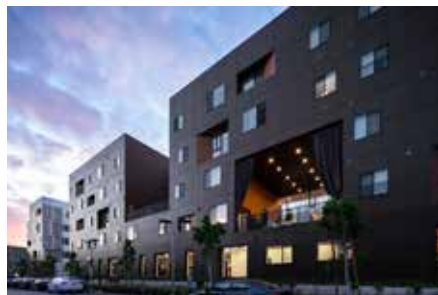
Prisma 182 Units Orange County, CA