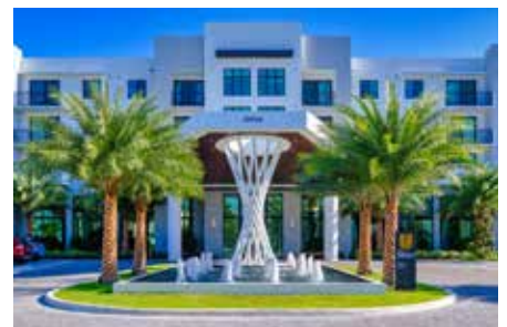
The Residences Uptown Boca 456 Units Boca Raton, FL