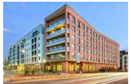
The Bishop 425 Units Atlanta, GA