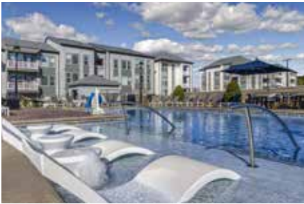
Solis City Park 272 Units Charlotte, NC