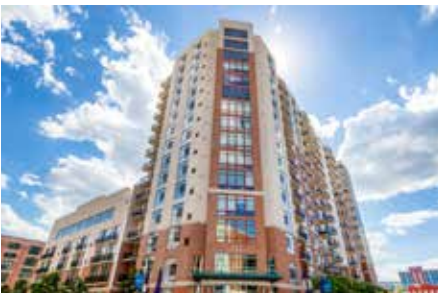
111 Harbor Point 228 units Stamford, CT