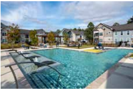
The Collins 272 Units New Orleans, LA