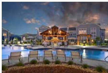
The Villas on Fir 290 Units Grander, IN