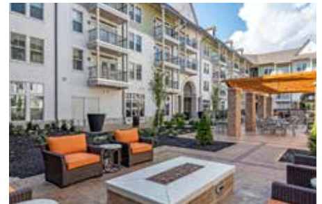
The Kessler 282 units Kansas City, KS