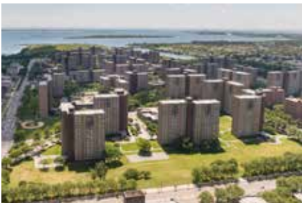
Spring Creek Towers 5,881 Units Brooklyn, NY