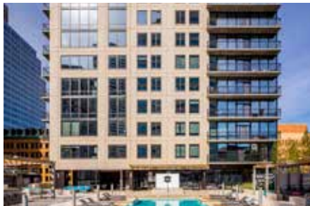
Nic on Fifth 258 units Minneapolis, MN