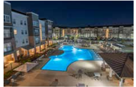
The Station at Town Madison 274 Units Huntsville, AL