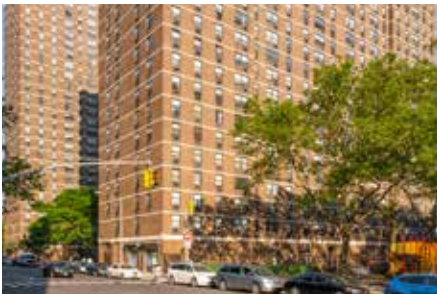
265-275 Cherry Street 490 Units Manhattan, NY