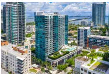
Midtown 5 400 Units Miami, FL