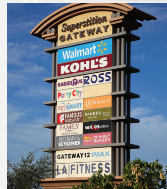
Superstition Gateway 495,506 sf | Mesa, AZ