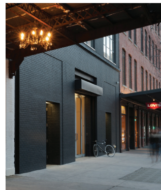
412 West 14th Street 42,614 sf | New York, NY