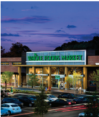
Peachtree Station 106,864 sf | Atlanta, GA