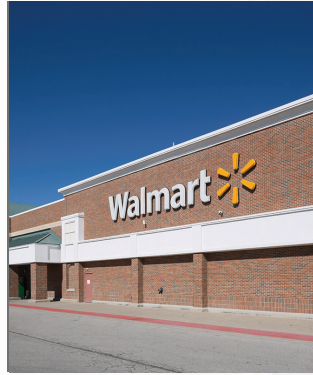
Carriage Place 280,910 sf | Columbus, OH