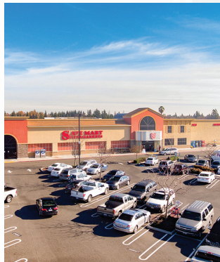
Northpointe Shopping Center 179,887 sf | Modesto, CA