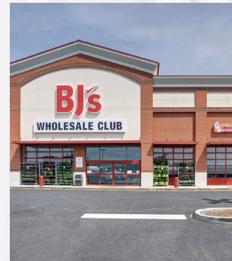
Kearny Square 138,895 sf | Kearny, NJ