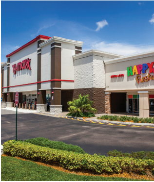
Westfork Plaza & Paraiso Parc 388,557 sf | Pembroke Pines, FL

Global trends are changing the way commercial real estate is leveraged in business today. Our clients depend on Cushman & Wakefield's Retail platform and capabilities, research and insights, and expert leadership across major markets worldwide. We believe increased business complexities generate fresh opportunities for innovation and new ideas to create what's next for our investors.