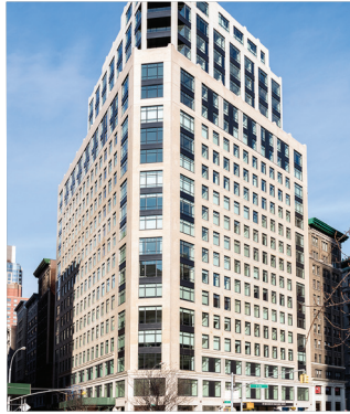
10 Madison Square West 20,676 sf | New York, NY