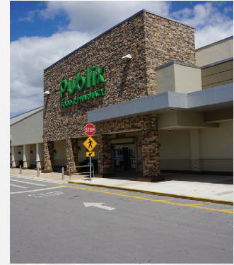
Doral Commons 138,091 sf | Miami, FL