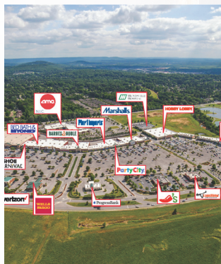
Valley Bend Shopping Center 425, 432 sf | Huntsville, AL