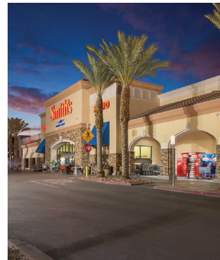
Montecito Marketplace 190,434 sf | Las Vegas, NV