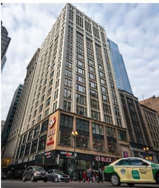
36 South State Street 18,799 sf | Chicago, IL