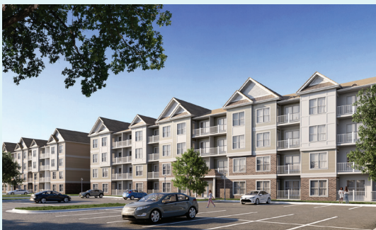
THE VILLAGE AT COMPASS POINTE Leland, NC Construction Financing Multifamily | 333,138 SF