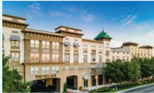
THE VILLAGE AT LAKE LILLY Maitland, FL Acquisition Financing Multifamily | 455 Units