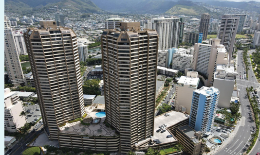
DISCOVERY BAY Honolulu, HI Acquisition Financing Mixed Use | 581,412 NRSF