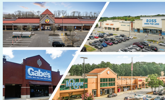
PROJECT INFINITY Various Refinance Retail | 745,000 SF