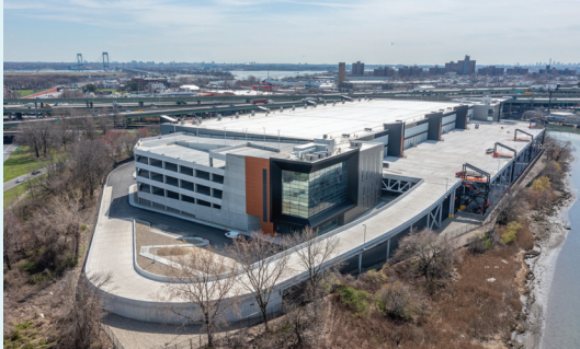
2505 BRUCKNER Bronx, NY Refinance (Mezz) Industrial | 1,067,554 SF