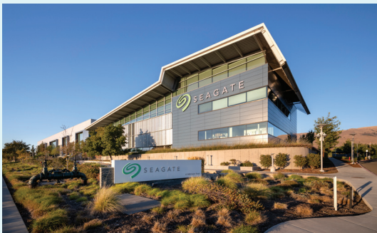
SEAGATE R&D CAMPUS Fremont, CA Acquisition Financing Office/Flex/R&D/Adv Mfg | 574,775 SF