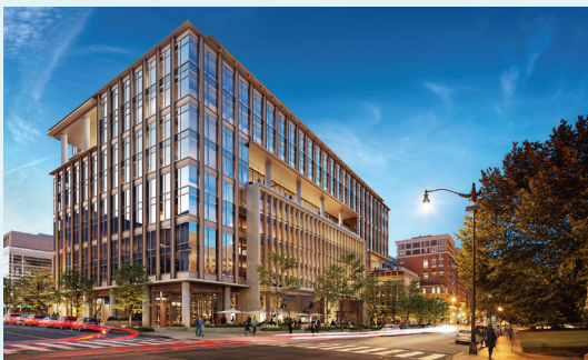
600 5TH ST NW Washington, D.C. JV Equity Office | 400,000 SF