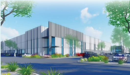
NORTHERN PARKWAY LOGISTICS Glendale, AZ Construction Financing Industrial | 676,169 SF