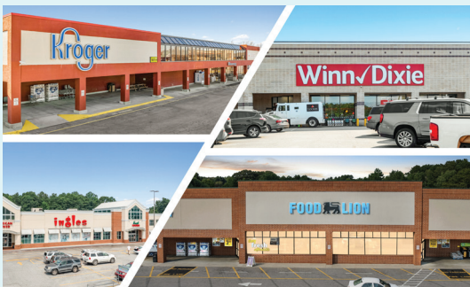
PROJECT LIGHTYEAR Various Refinance Retail | 1,060,000 SF