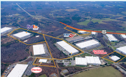
PROJECT CARDINAL PORTOLIO Various, North Carolina Acquisition Financing Industrial / Land | 1,500,000 SF