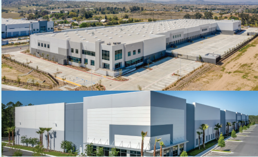
PROJECT MINT National Refinance Industrial | 1,939,406 SF