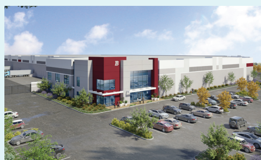
I-215 LOGISTICS CENTER Las Vegas, NV Acquisition Financing Industrial | 400,766 SF