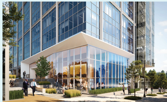
NOVEL MIDTOWN Atlanta, GA Acquisition Financing Multifamily | 340 Units