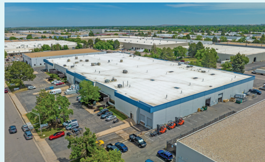
PROJECT REDHAWK Denver & Pompano Beach, CO & FL Acquisition Financing Industrial | 1,300,133 SF