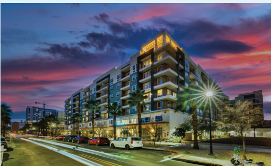
THE REY Phoenix, AZ Refinance Multifamily | 323 Units