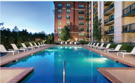
PROMENADE PLACE Greenwood Village, CO Refinance Multifamily | 387 Units