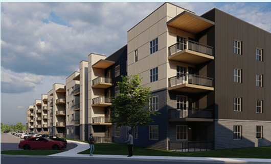
CANYON INDUSTRIAL CENTER Boise, ID Construction Financing Multifamily | 198,728 SF