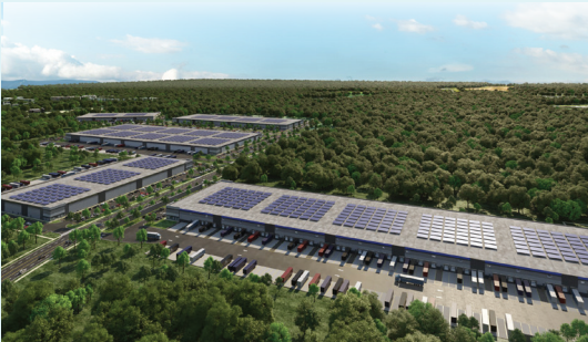
NATIONAL CAPITAL BUSINESS PARK Various, MD Construction Financing Industrial - Land | 1,323,452 SF