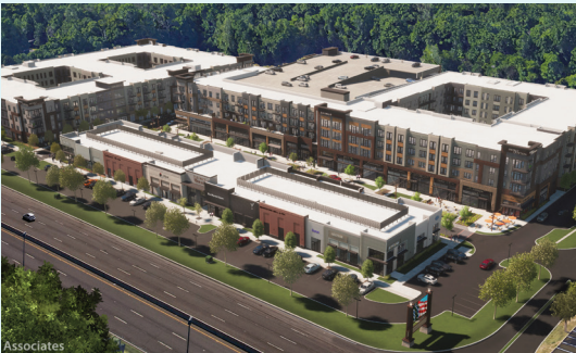
THE DISTRICT AT 15FIFTEEN Parsippany, NJ Construction Financing Multifamily / Retail | 467,229 SF