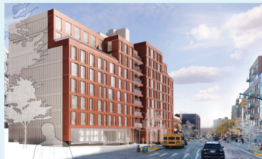
975 NOSTRAND AVENUE Brooklyn, NY Construction Financing Land - Mixed Use / Multi | 350,231 SF