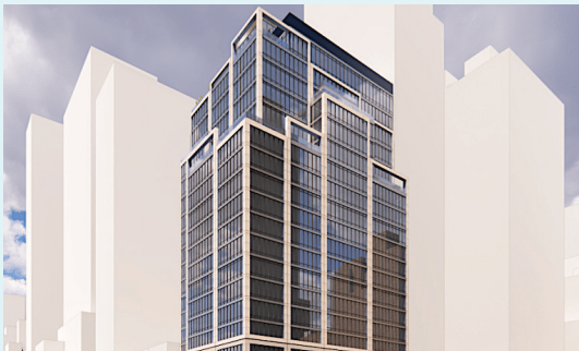
255 EAST 39TH STREET New York, NY Construction Financing Multifamily / Retail | 120,052 SF