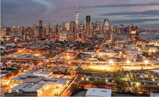
THE BEACON Jersey City, NJ Refinance Multifamily | 1,155 Units