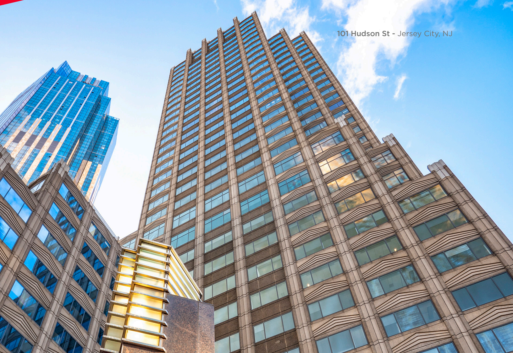
101 Hudson St - Jersey City, NJ