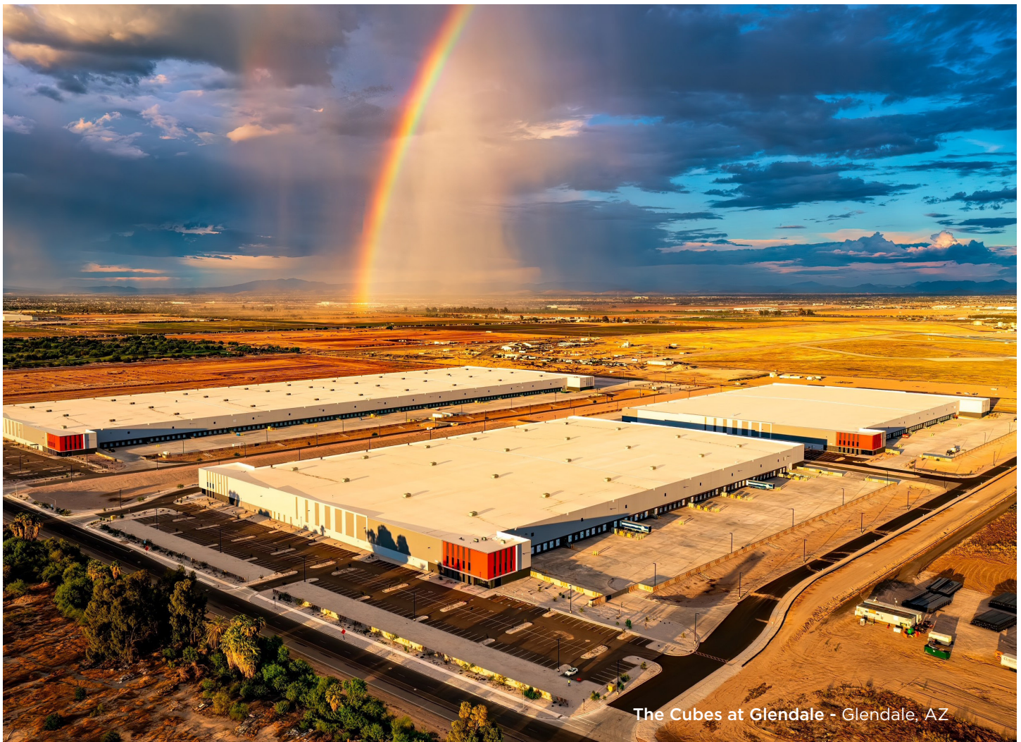
The Cubes at Glendale - Glendale, AZ