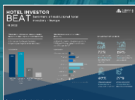
HOTEL INVESTOR BEAT – Europe: H1 2022