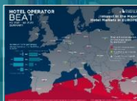
HOTEL OPERATOR BEAT – Europe: H2 2021- H1 2022