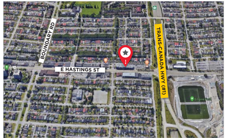
EAST HASTINGS STREET