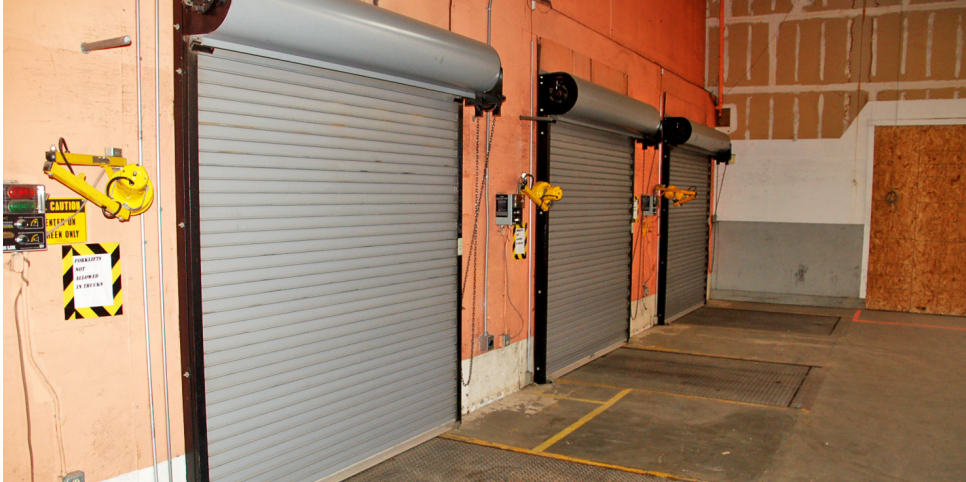
THREE DOCK HIGH ROLL UP DOORS