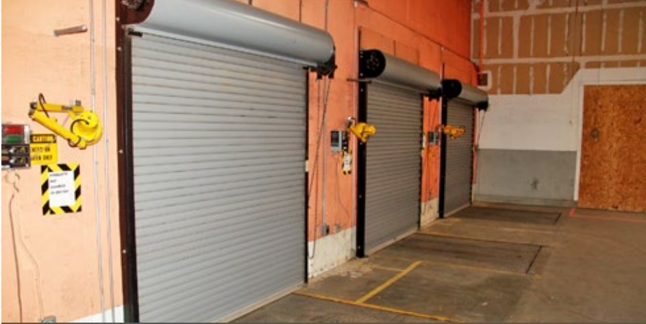
THREE DOCK HIGH ROLL UP DOORS