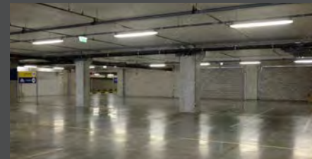
Ample Covered Parking