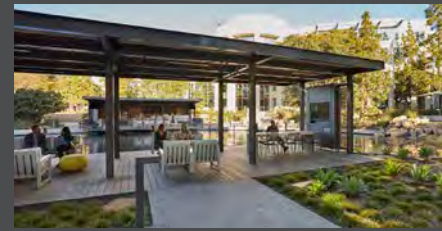
Beautifully landscaped park like setting with lake