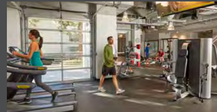
On-site indoor-outdoor fitness center with locker room