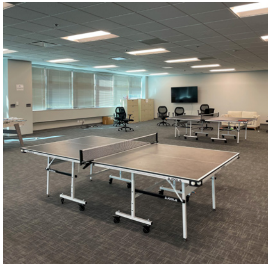
SUITE 400 | 17,399 SF