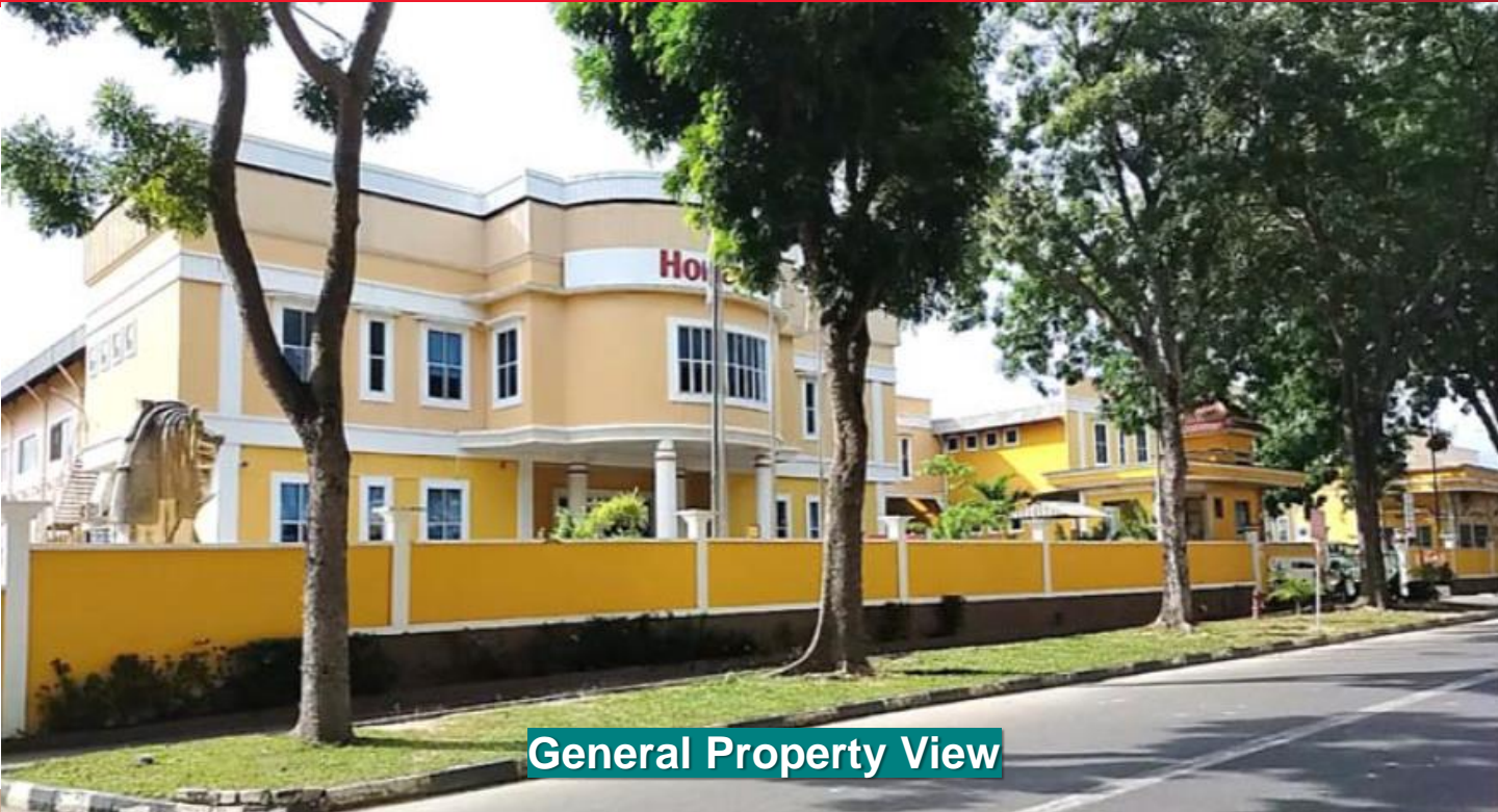
General Property View

INDUSTRIAL PROPERTY AT LATRADE TJ. UNCANG - BATAM