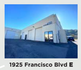
1925 Francisco Blvd E