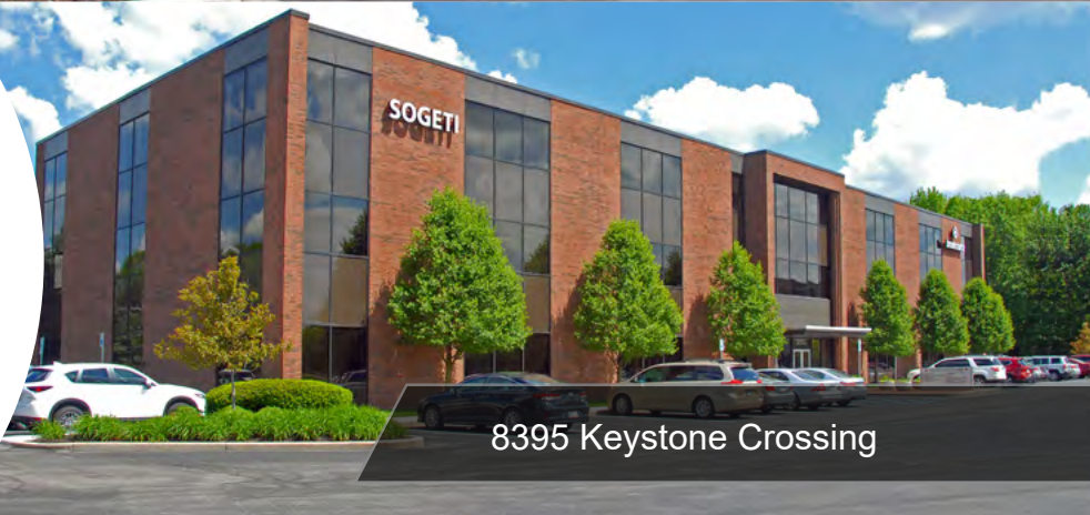
8395 Keystone Crossing