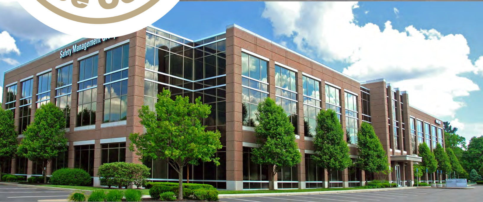
8335 Keystone Crossing