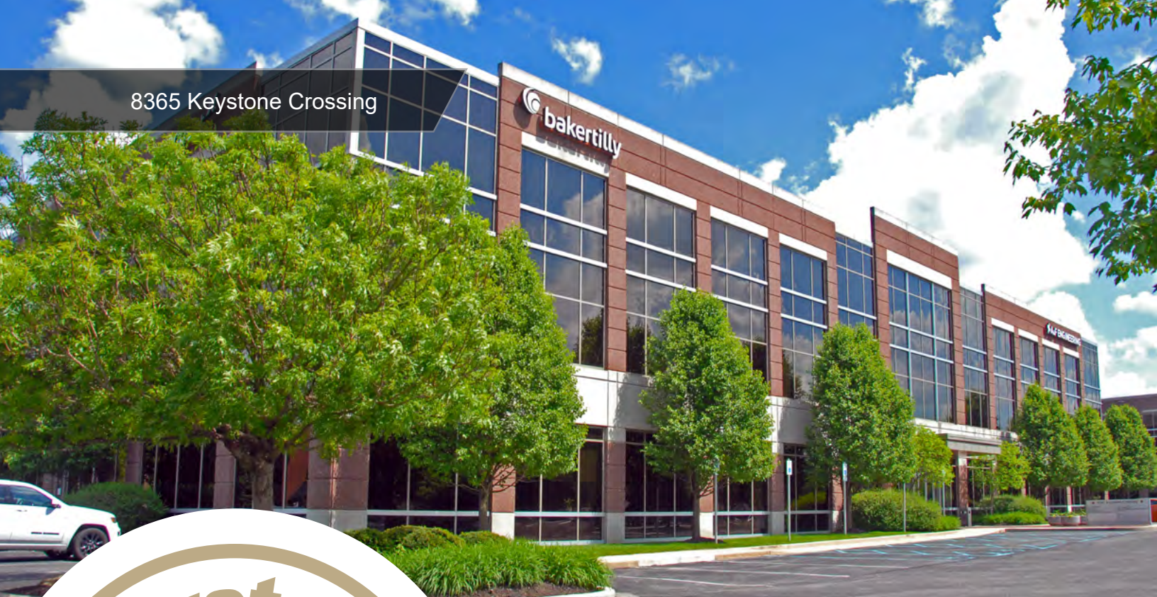
8365 Keystone Crossing