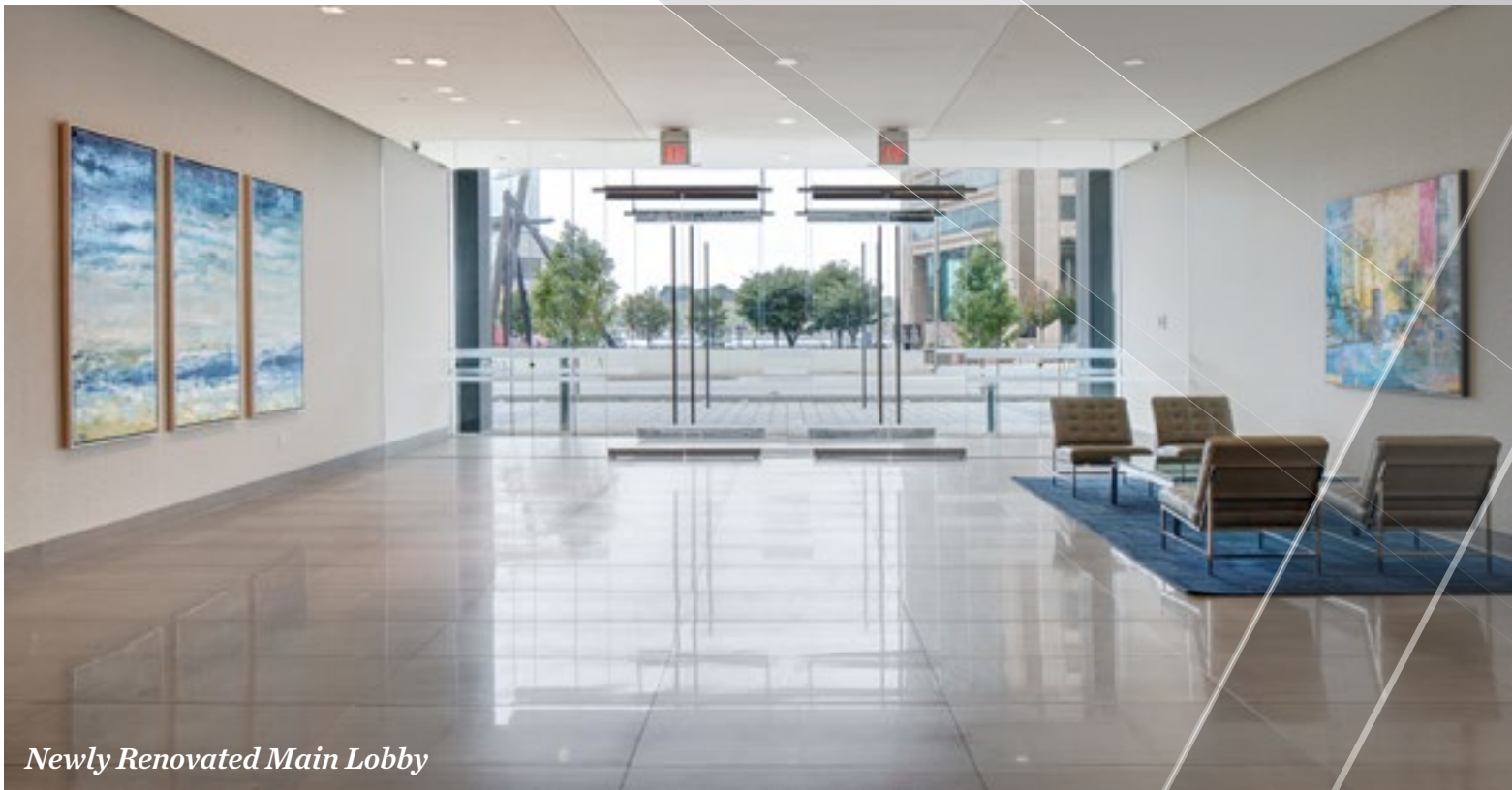
Newly Renovated Main Lobby