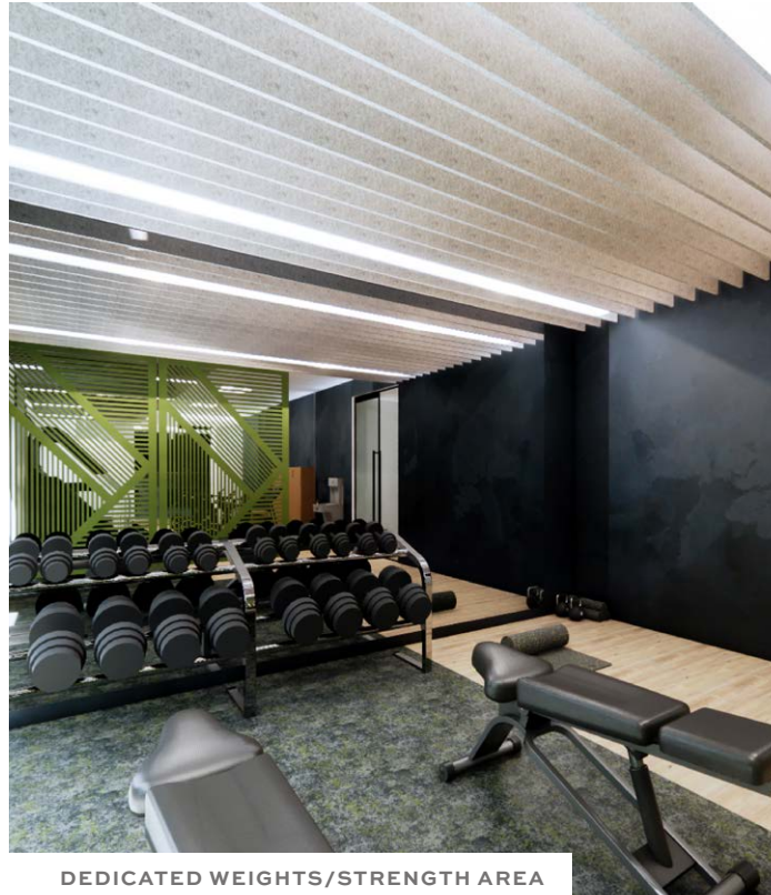
DEDICATED WEIGHTS/STRENGTH AREA