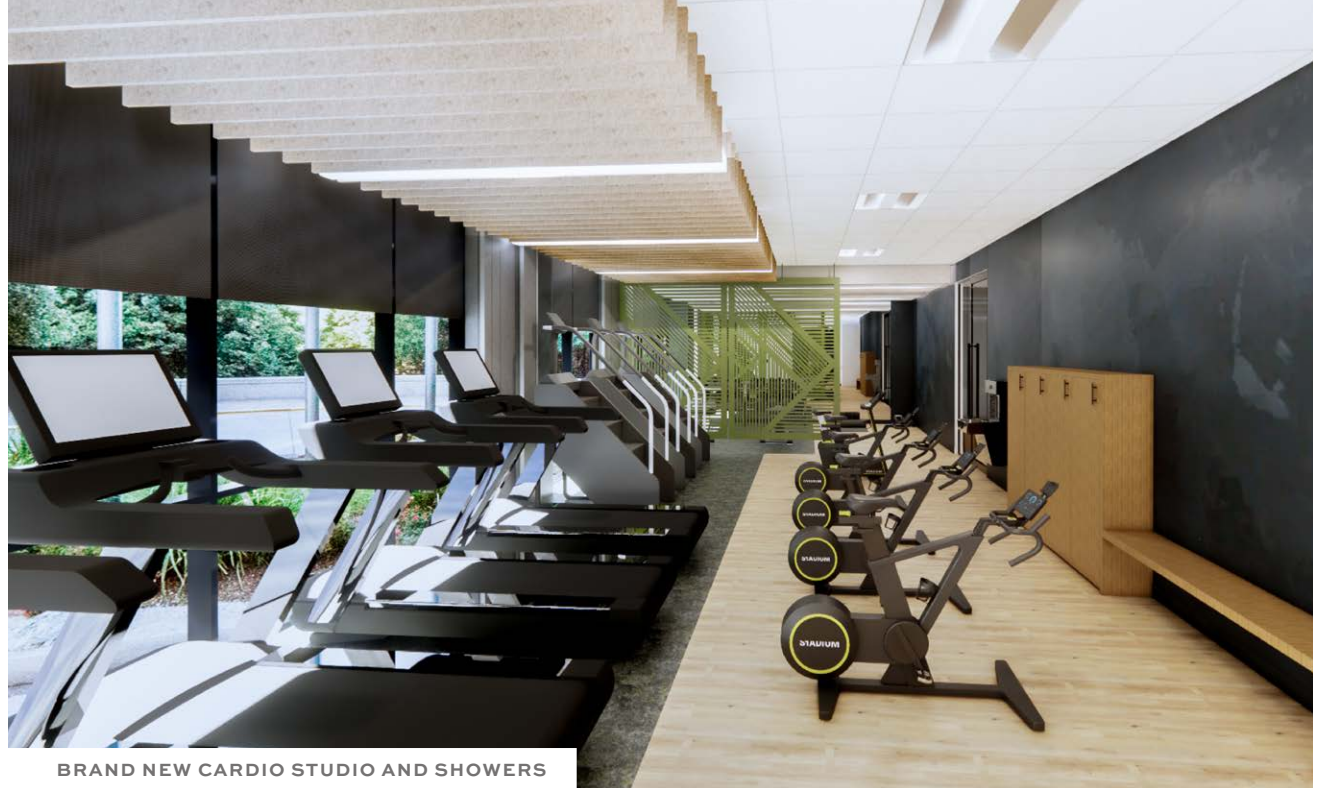
BRAND NEW CARDIO STUDIO AND SHOWERS

It's a place where employees can exercise, relax, and rejuvenate amidst nature's beauty.