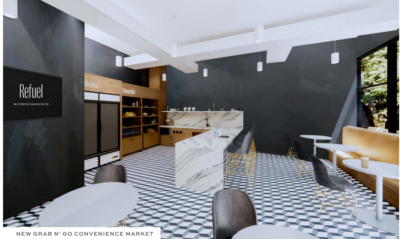
NEW GRAB N' GO CONVENIENCE MARKET

Our modern campus offers businesses of all sizes the opportunity to work in an amenity-rich environment surrounded by nature trails, dining, shopping, and entertainment.