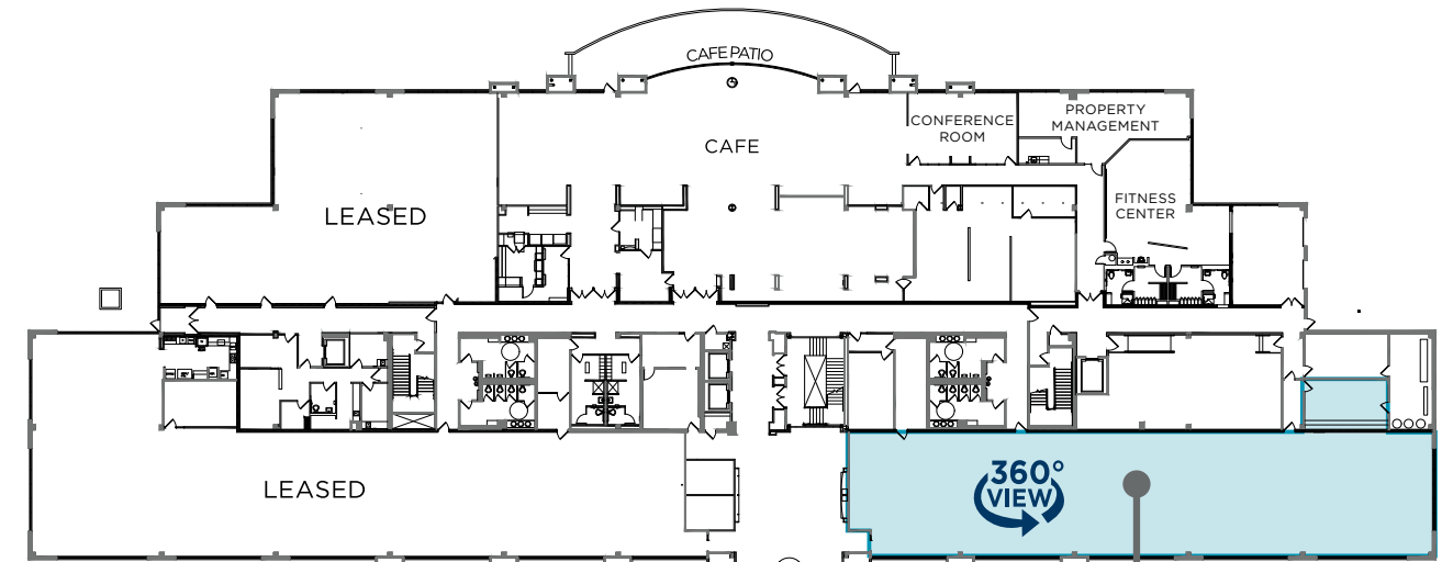
7,110 RSF 1 ST FLOOR CORNER SUITE WITH FULL HEIGHT GLASS WITH MAIN LOBBY EXPOSURE