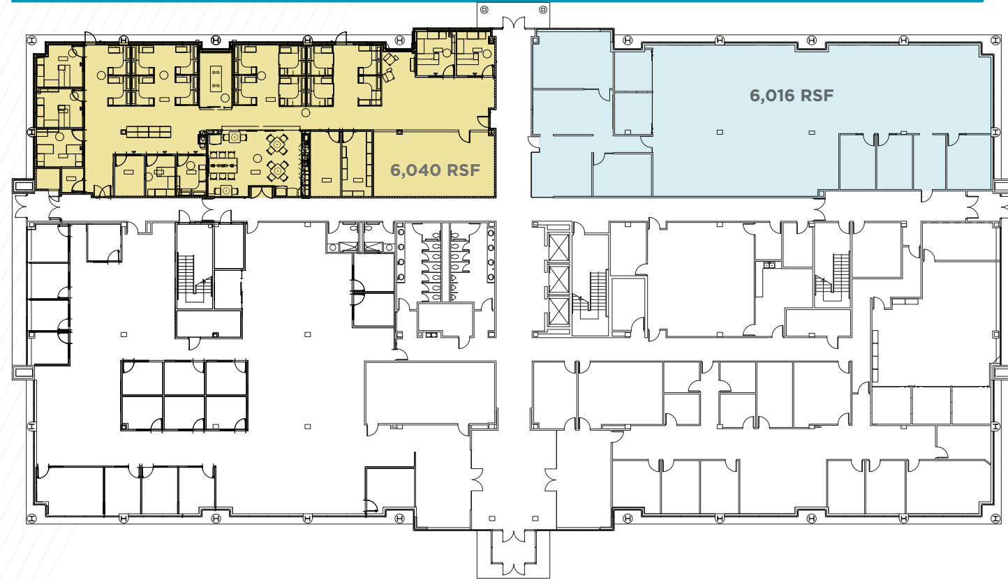
FIRST FLOOR 6,040 RSF (FURNITURE AVAILABLE) FIRST FLOOR 6,016 RSF