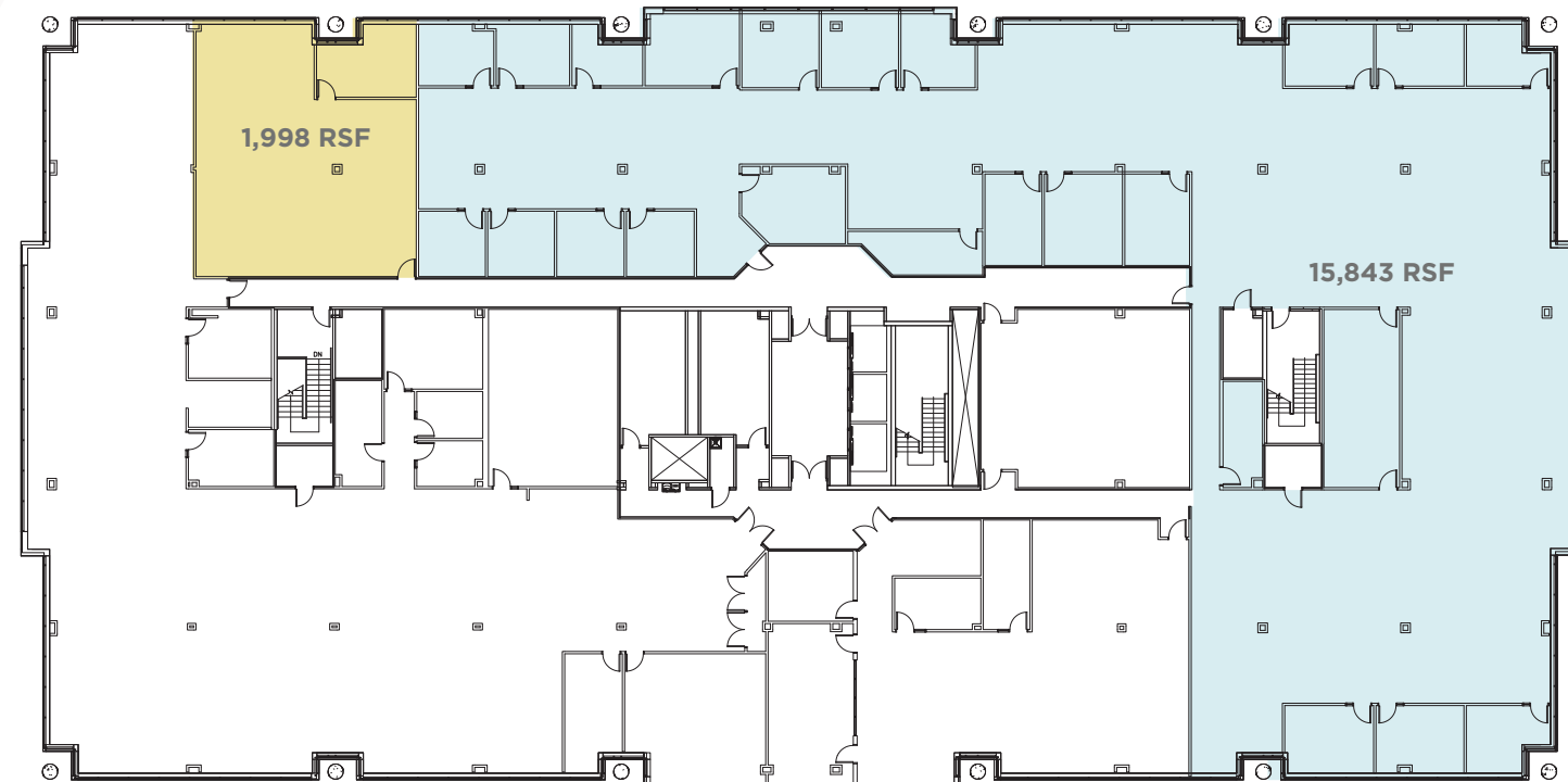
SECOND FLOOR 1,998 TO 17,841 RSF AVAILABLE (WILL DEMISE)