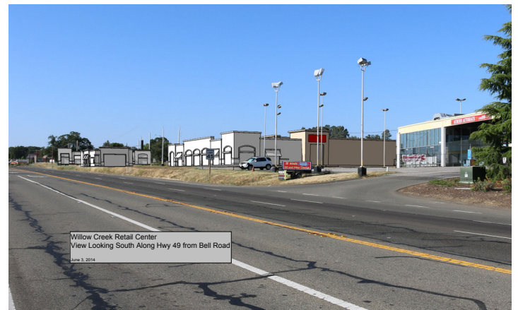
Willow Creek Retail Center View Looking South Along Hwy 49 from Bell Road June 3, 2014