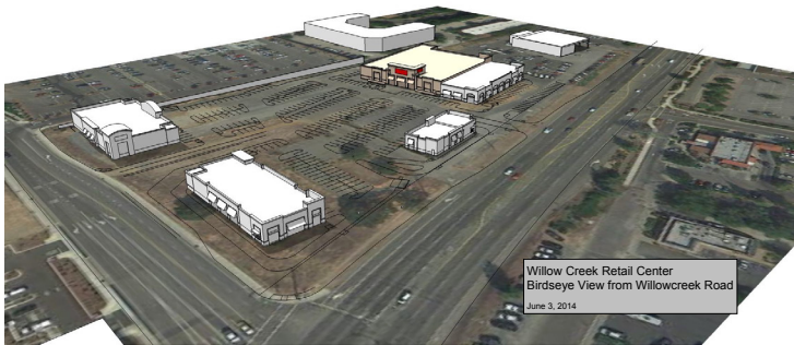
Willow Creek Retail Center Birdseye View from Willowcreek Road June 3, 2014