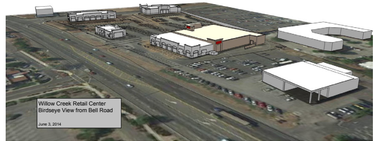
Willow Creek Retail Center Birdseye View from Bell Road June 3, 2014