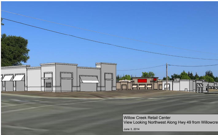
Willow Creek Retail Center View Looking Northwest Along Hwy 49 from Willowcreek Road June 3, 2014