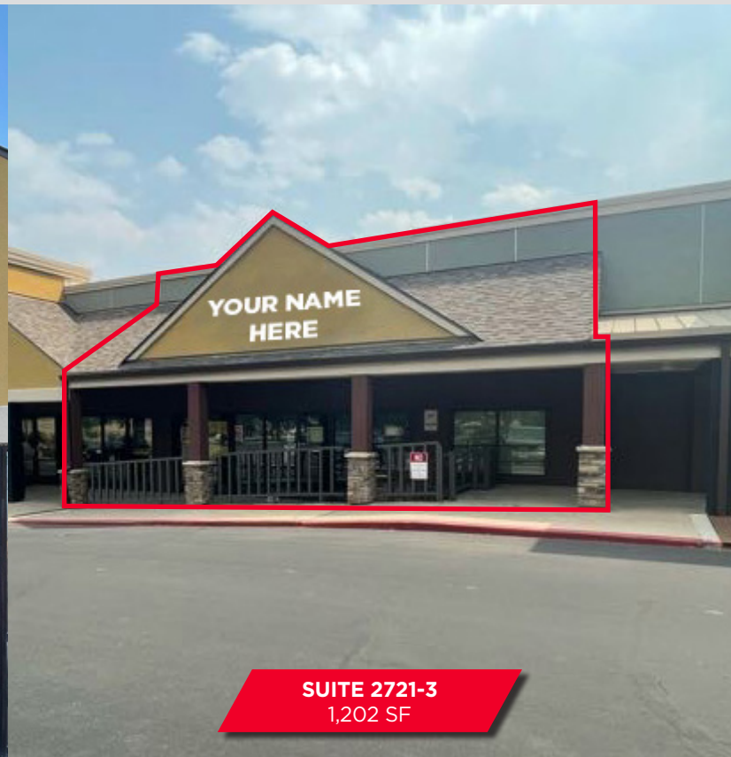
SUITE 2721-3 1,202 SF