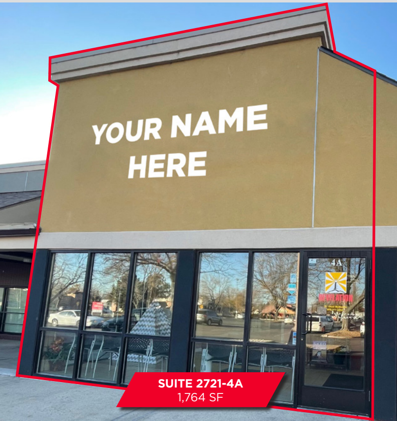
SUITE 2721-4A 1,764 SF

2701 - 2721 S. COLLEGE AVENUE FORT COLLINS, COLORADO 80525