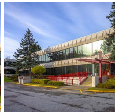
4299 Canada Way