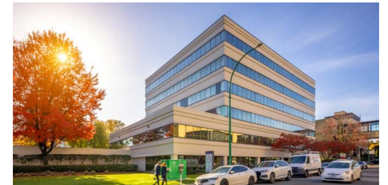
4370 Dominion Street