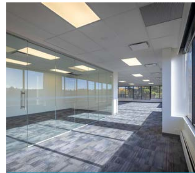
Unit 440 4400 Dominion Street