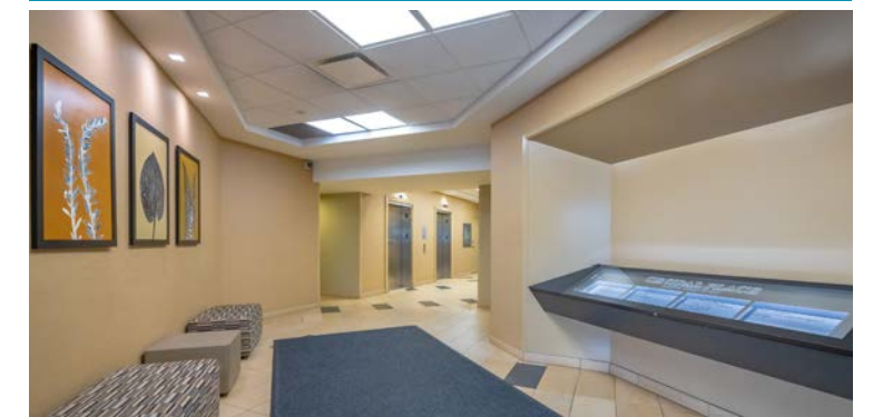
4370 Dominion Main Lobby