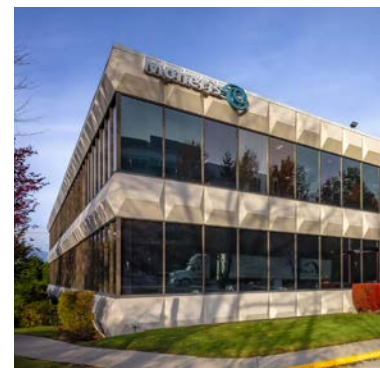
4259 Canada Way