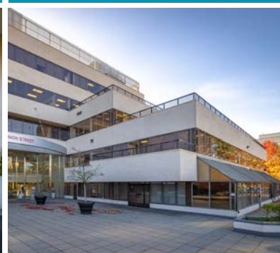
4400 Dominion Street