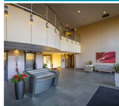
4400 Dominion Street