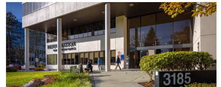
3185 Willingdon Green