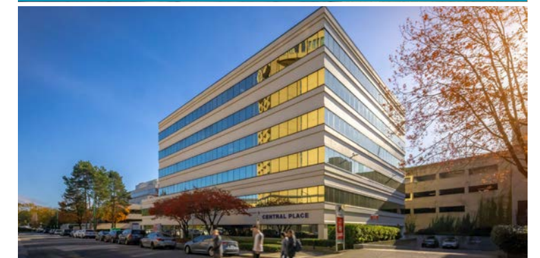
4370 Dominion Street