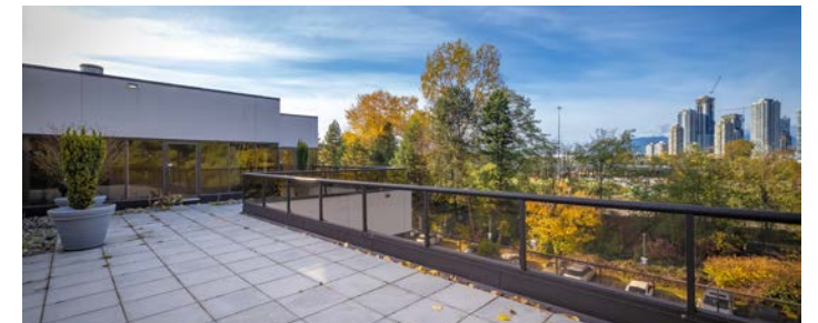
Unit 304 Balcony | 3185 Willingdon Green