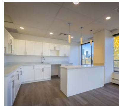
Unit 440 Kitchen 4400 Dominion Street