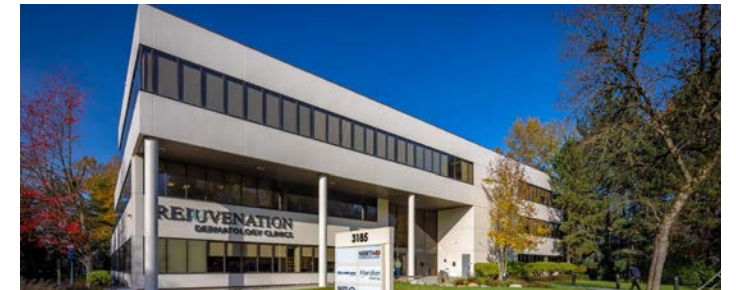
3185 Willingdon Green