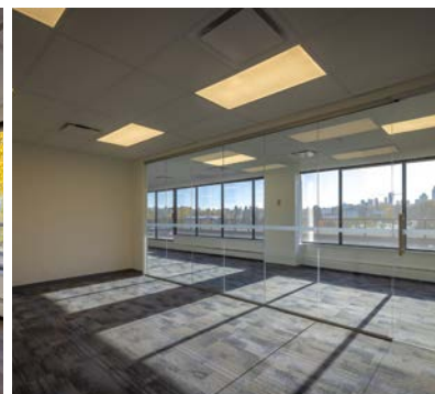
Unit 440 4400 Dominion Street