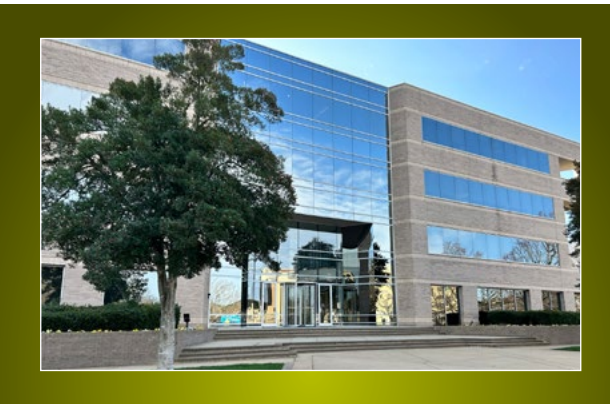
CENTREPORT II - 202 CentrePort Dr