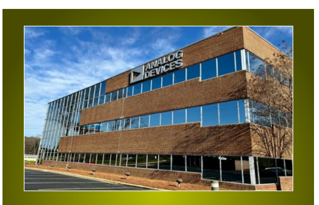
CENTREPORT IV - 7736 McCloud Rd