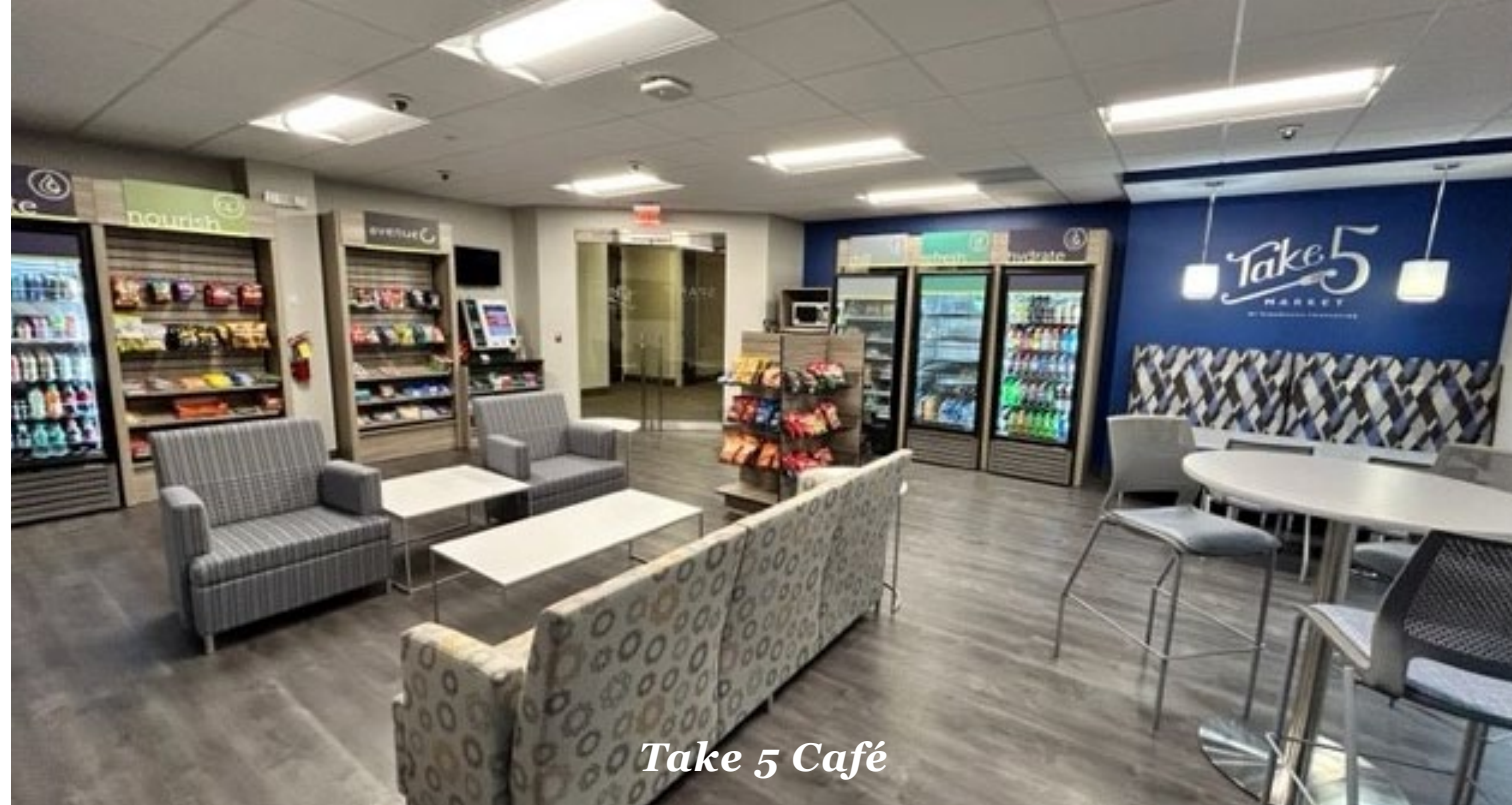
Take 5 Café