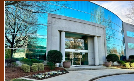
7029 ALBERT PICK ROAD

Total Size: 55,529 SF Year Built: 1997 Floors: 3 Telecom/Fiber: Spectrum, AT&T