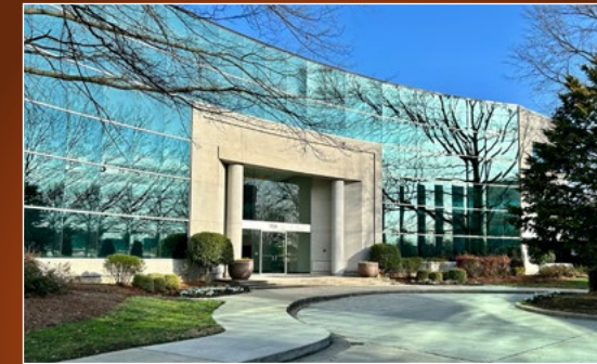
7031 ALBERT PICK ROAD

Total Size: 55,638 SF Year Built: 1988 (Renovated 2014) Floors: 6 Telecom/Fiber: Spectrum, AT&T