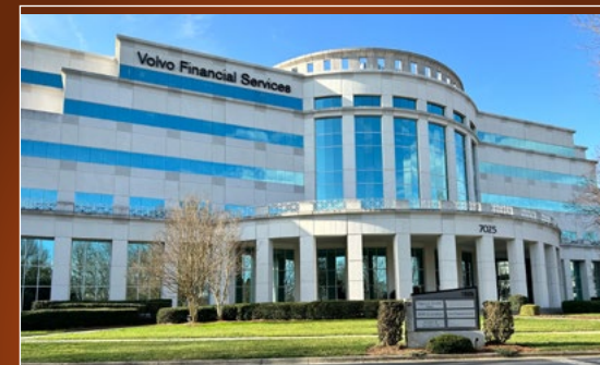
7025 ALBERT PICK ROAD

Total Size: 133,239 SF Year Built: 1990 Floors: 6 Telecom/Fiber: Spectrum, AT&T