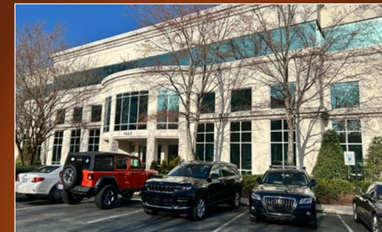
7027 ALBERT PICK ROAD

Total Size: 133,239 SF Year Built: 1990 Floors: 6 Telecom/Fiber: Spectrum, AT&T