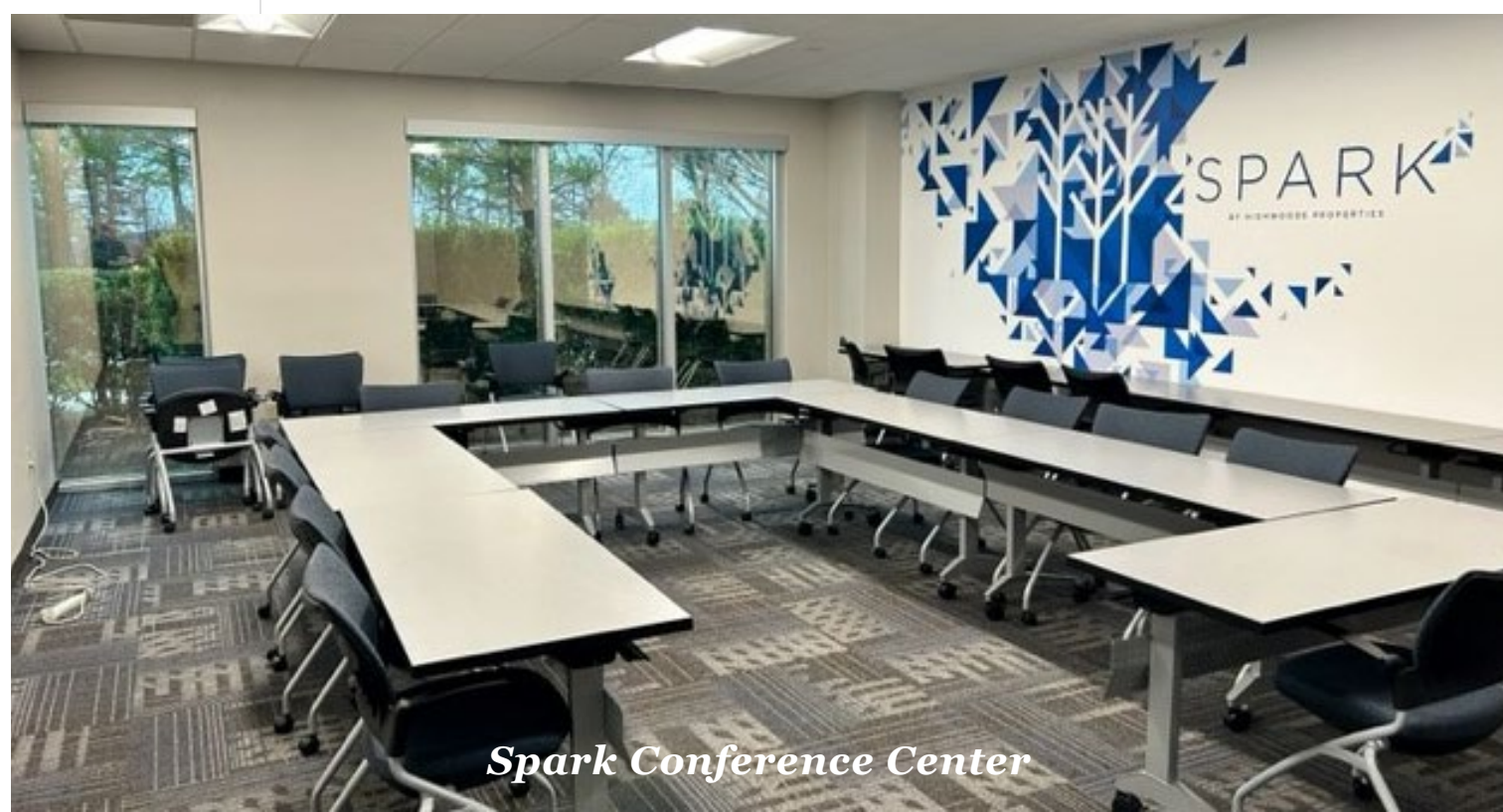
Spark Conference Center