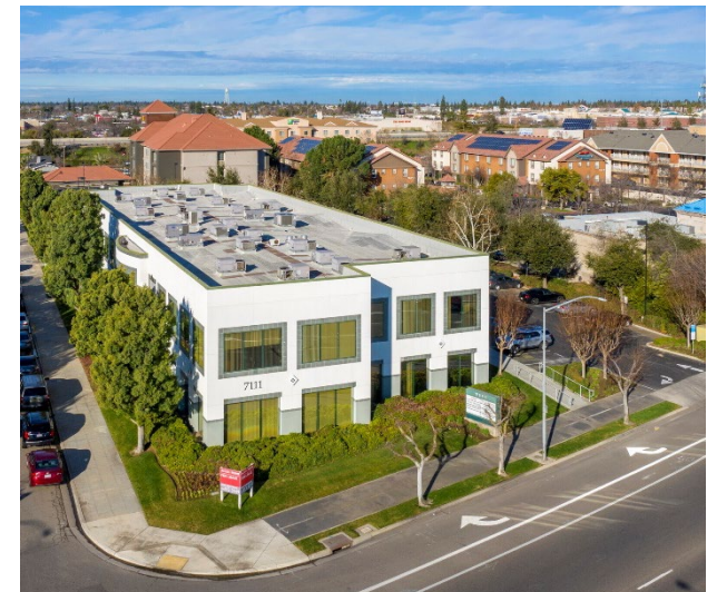
MONUMENT SIGN & BLDG