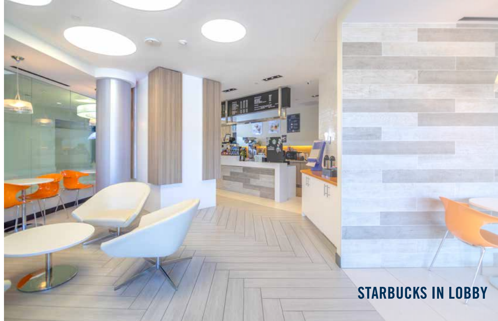
STARBUCKS IN LOBBY