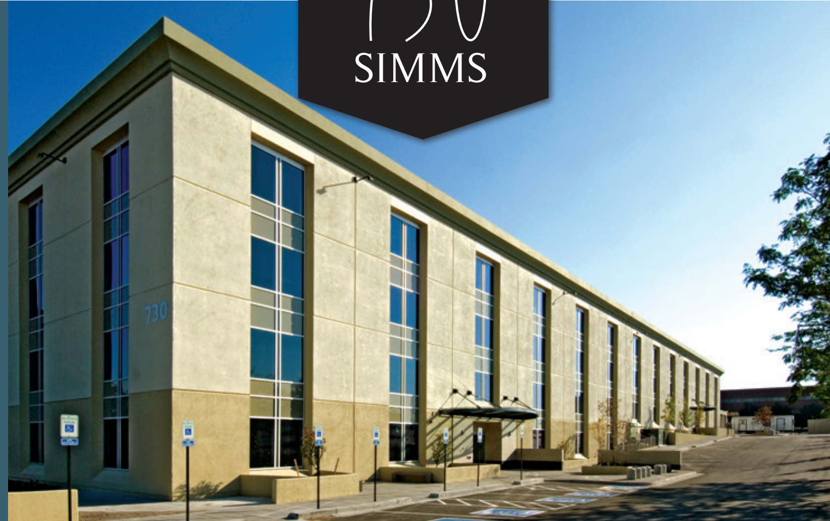
730 Simms Street | Lakewood, Colorado

$7.5 Million Renovation Complete including New Windows, Elevators, HVAC, Electrical, Bathrooms, Lobby Finishes and Sprinklers!