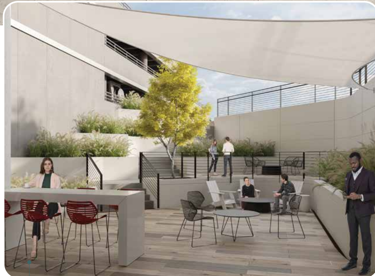
Cafe Patio Seating