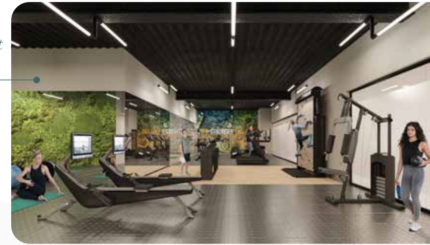
State-Of-The-Art Fitness Center