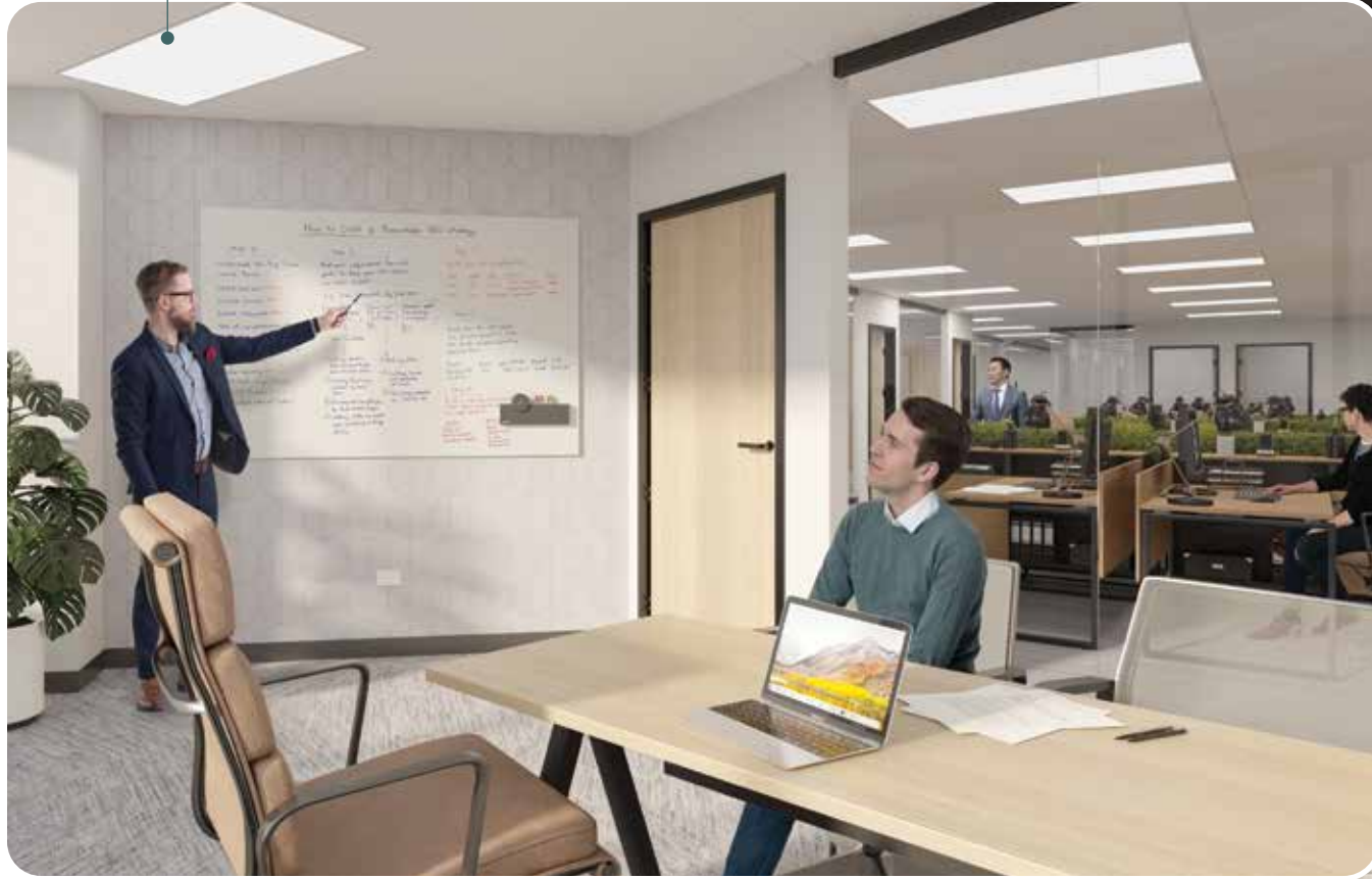
Suite 1275 Office