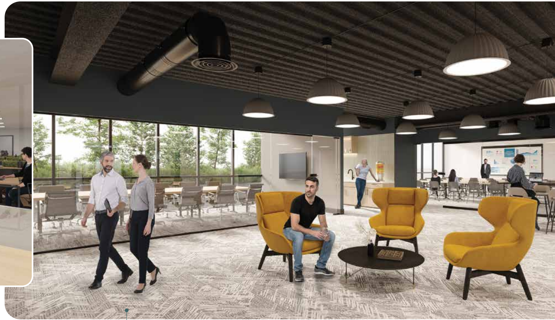
Conference Center & Management Office