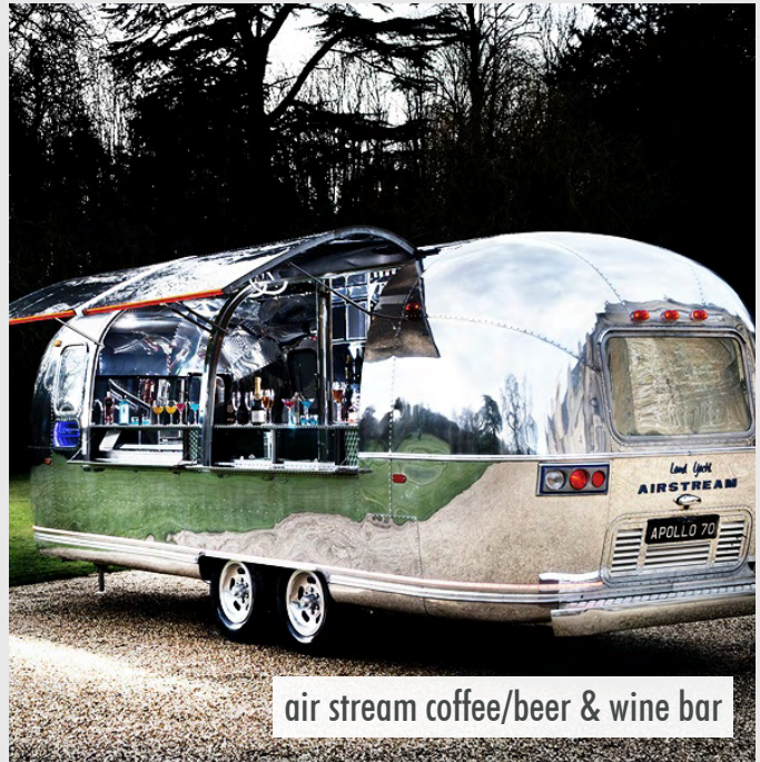
air stream coffee/beer & wine bar