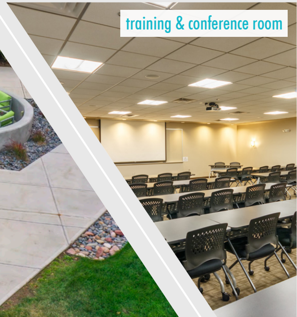
training & conference room