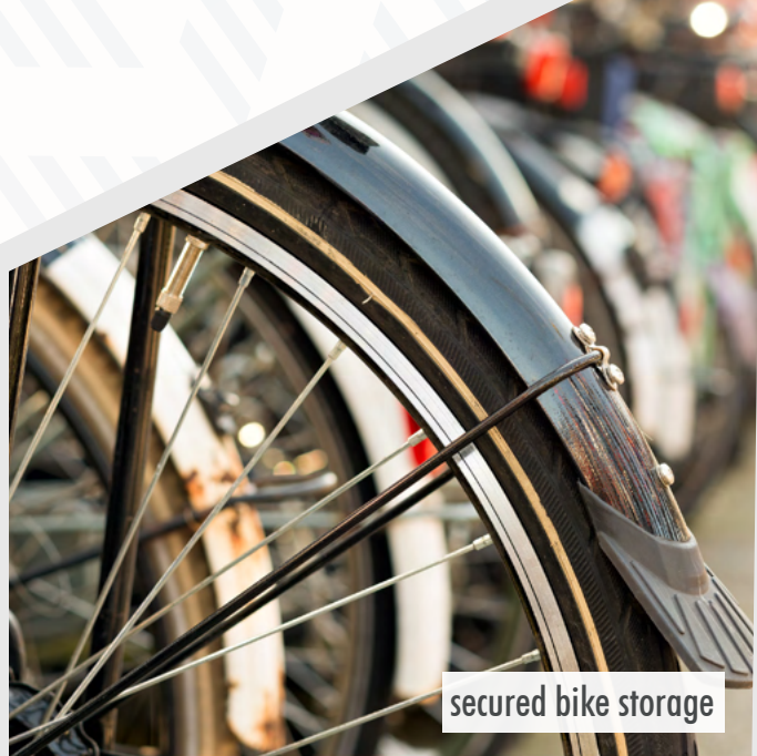
secured bike storage