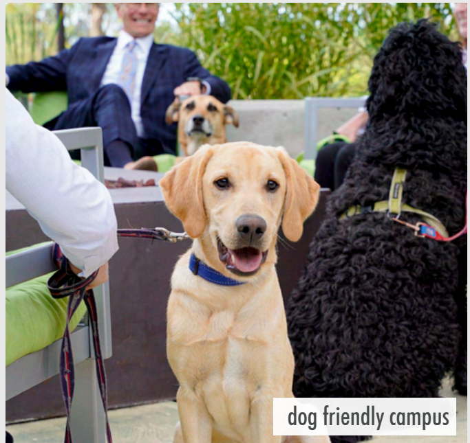
dog friendly campus