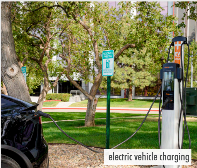
electric vehicle charging