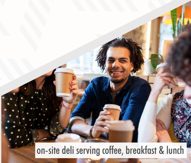
on-site deli serving coffee, breakfast & lunch