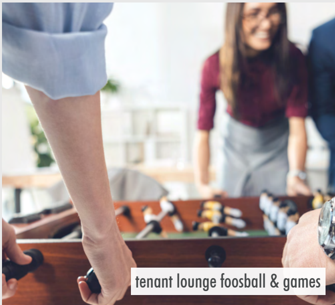
tenant lounge foosball & games