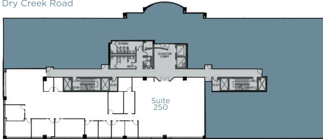
10303 E. Dry Creek Road