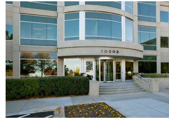
E. DRY CREEK ROAD