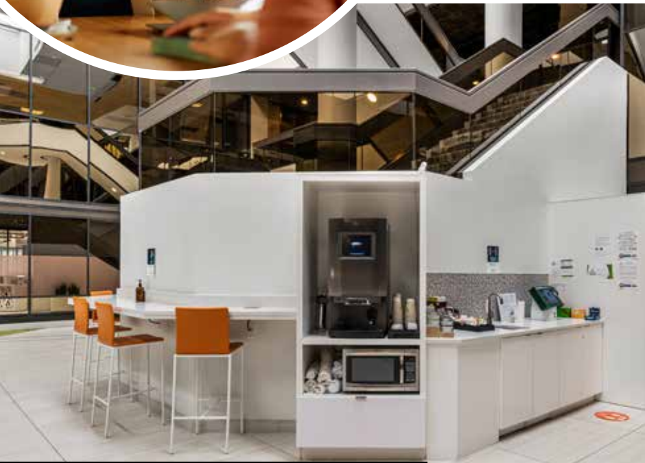
Grab & Go Market