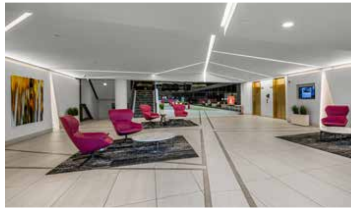
Large Training Room