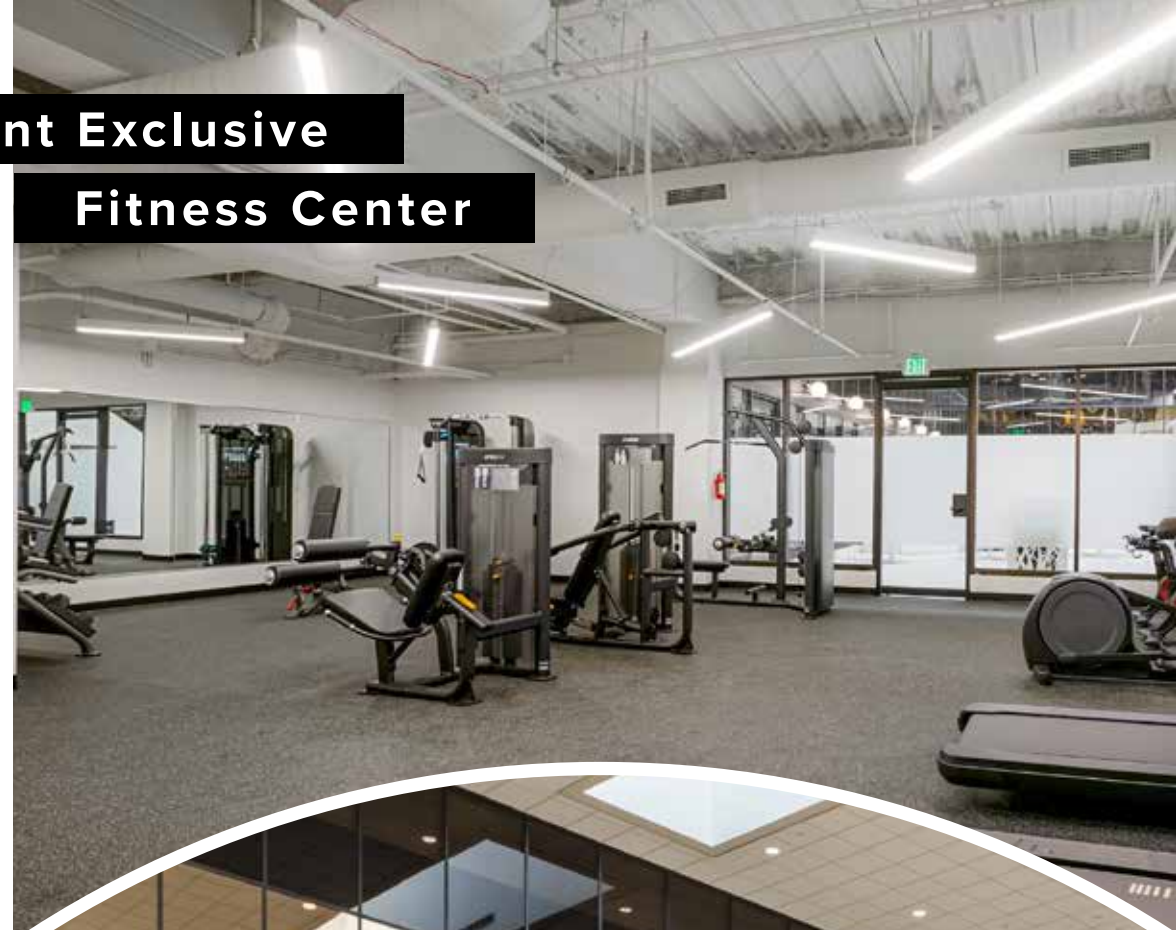
Tenant Exclusive Fitness Center