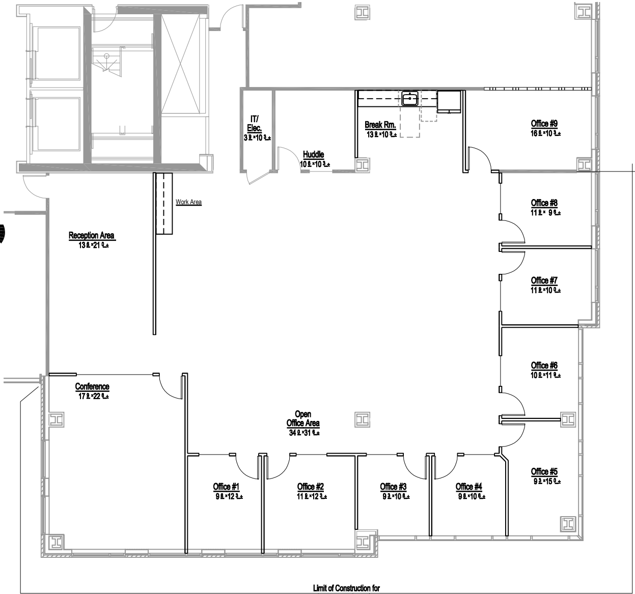
1 Preliminary Space Plan #1, Rev. #2 Suite 475 4822 RSF (Approx.)