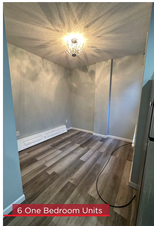
6 One Bedroom Units