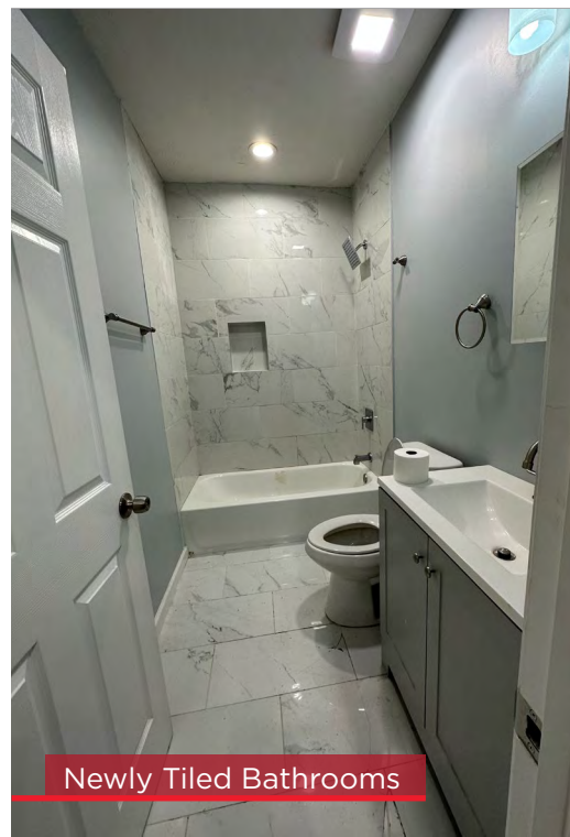
Newly Tiled Bathrooms