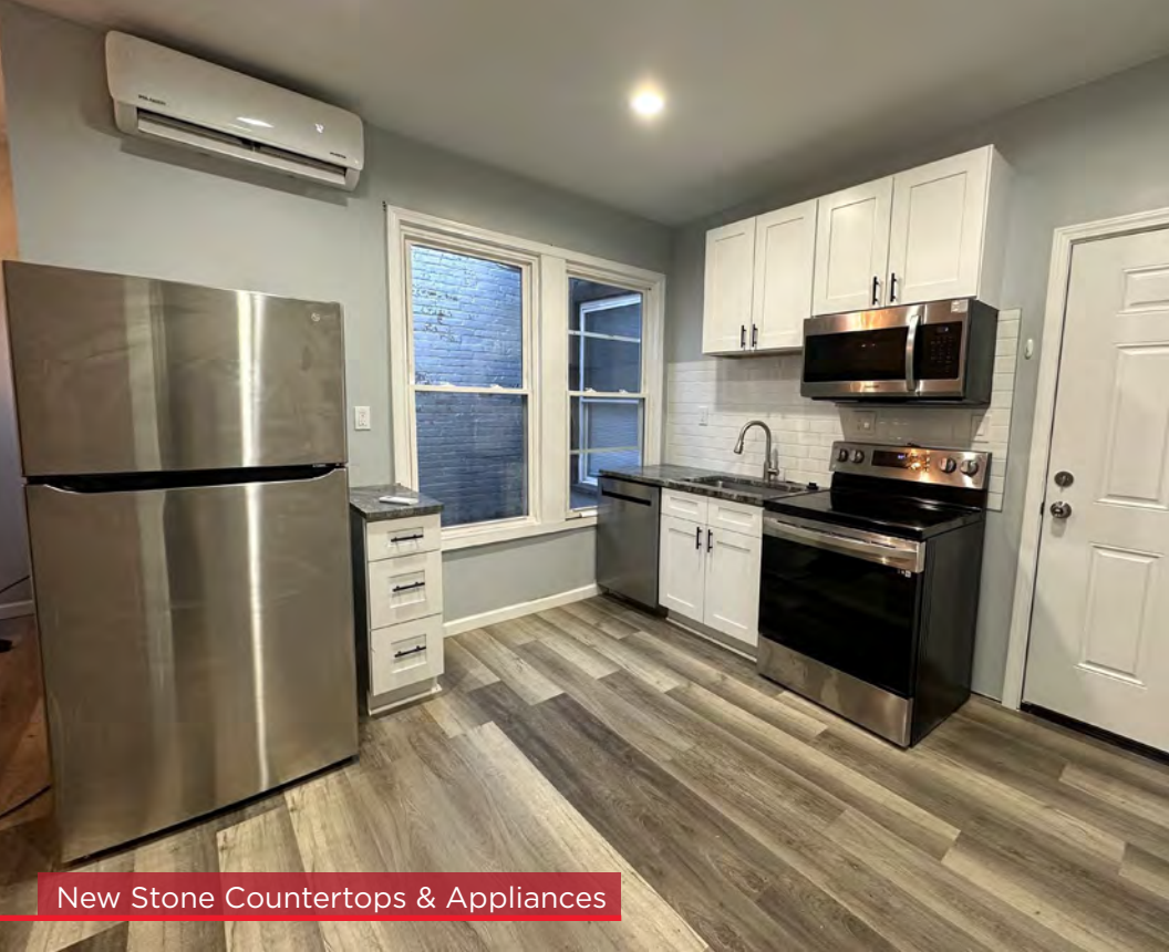
New Stone Countertops & Appliances