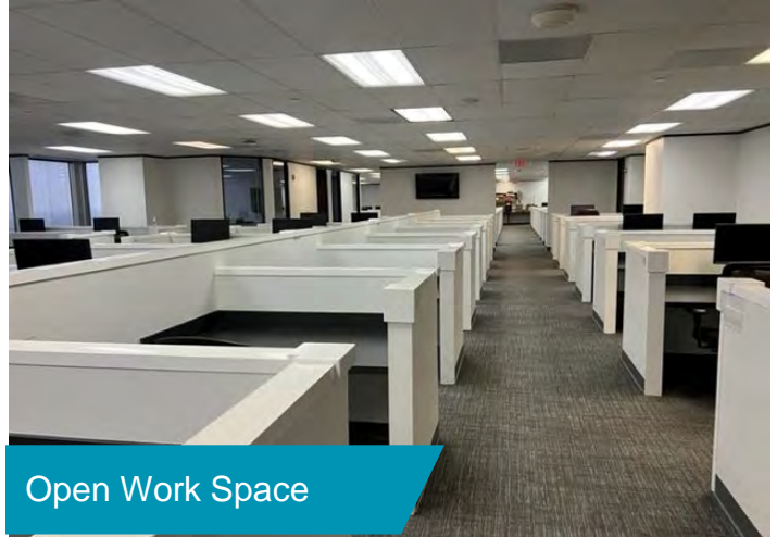
Open Work Space