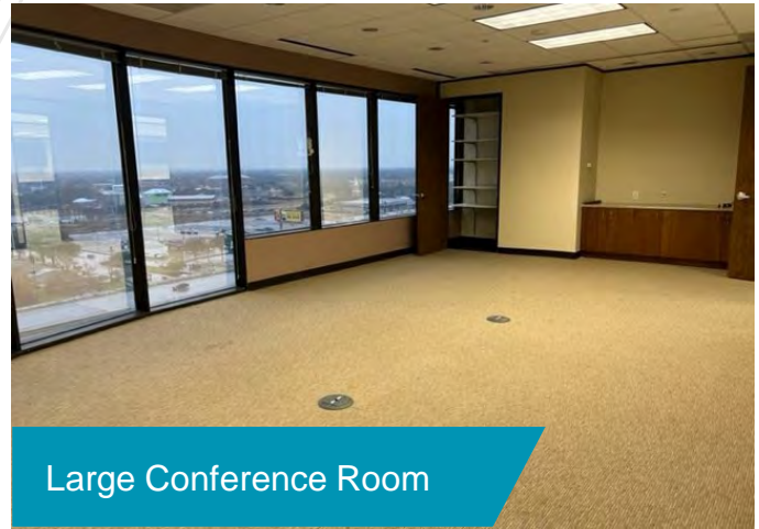
Large Conference Room