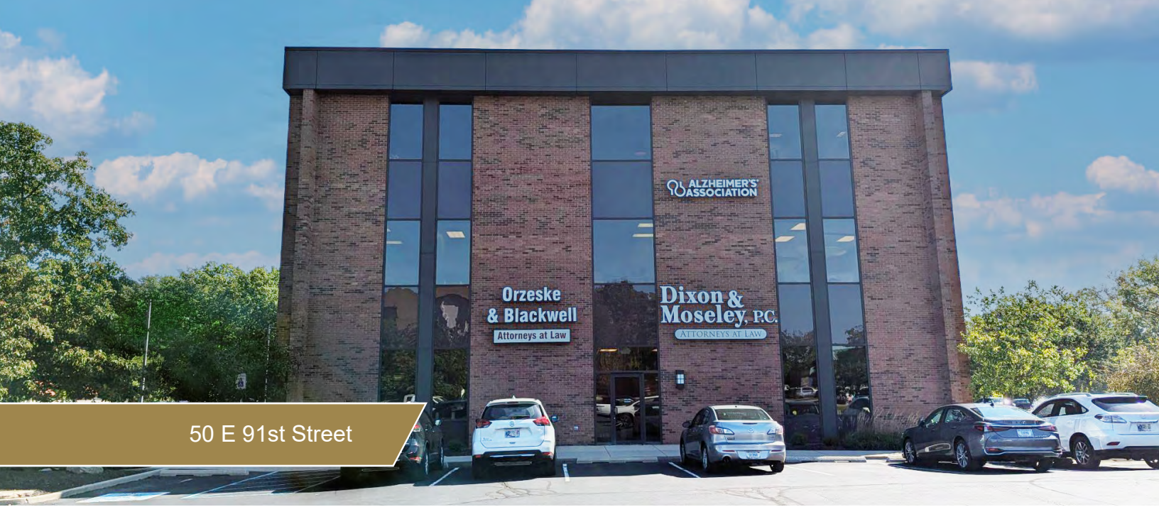
50 E 91st Street