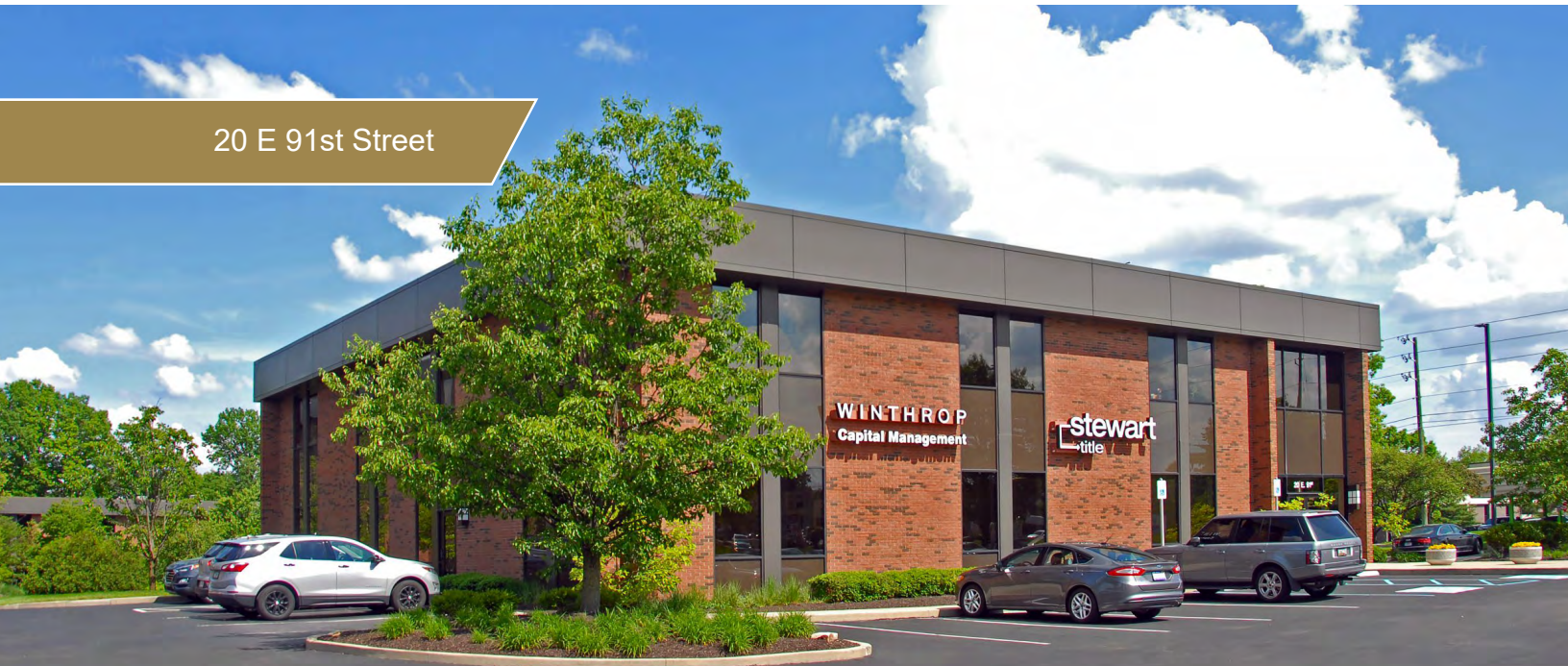
20 E 91st Street