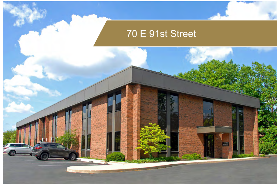
70 E 91st Street