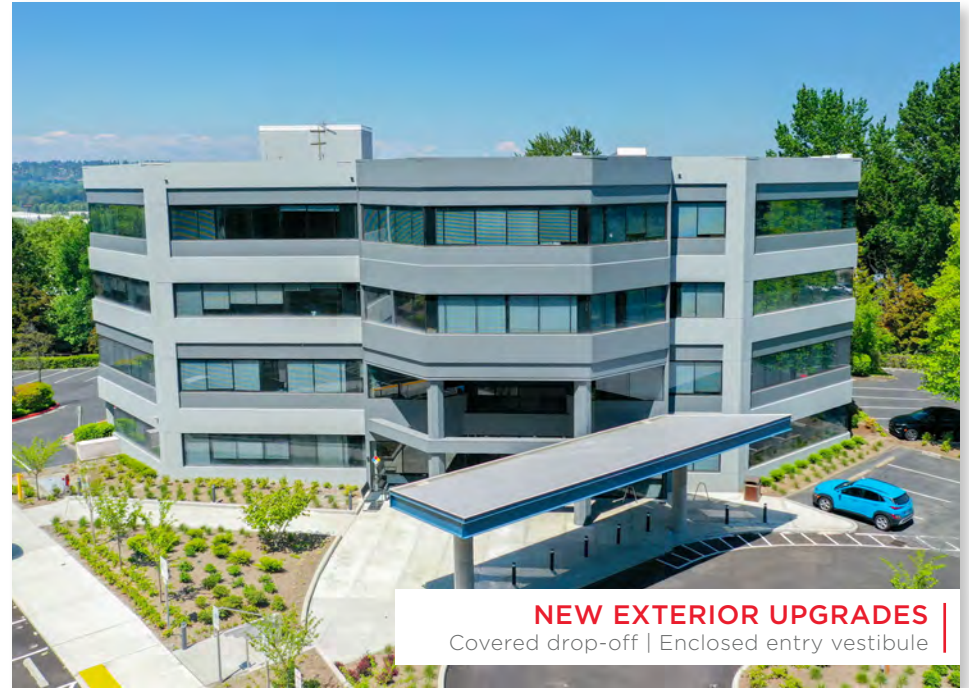
NEW EXTERIOR UPGRADES Covered drop-off | Enclosed entry vestibule

Future MOB Proposed 42K SF development adjacent to site