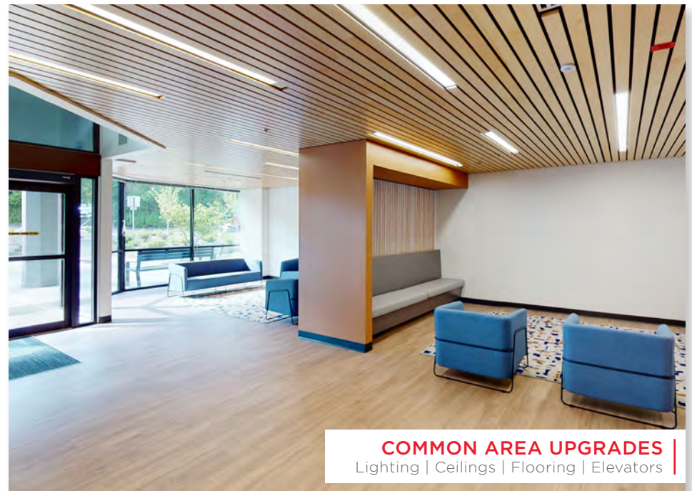
COMMON AREA UPGRADES Lighting | Ceilings | Flooring | Elevators