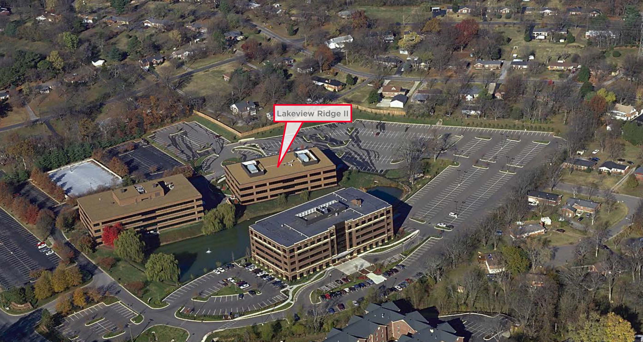
Lakeview Ridge II