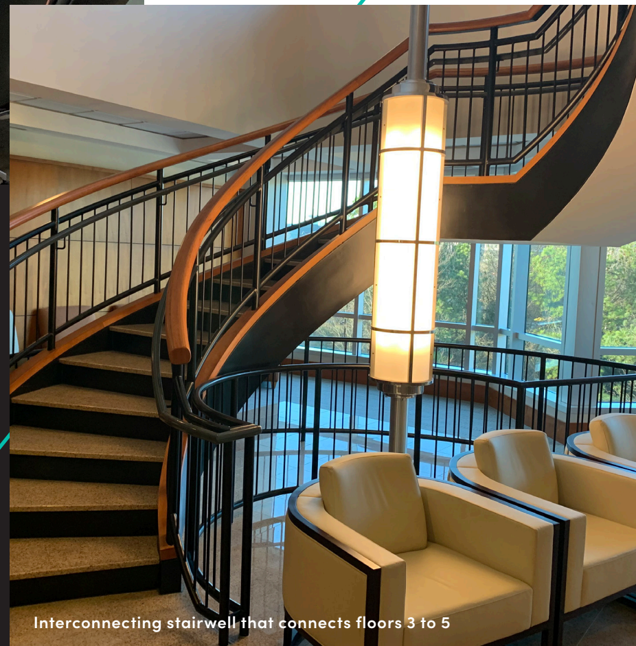
Interconnecting stairwell that connects floors 3 to 5