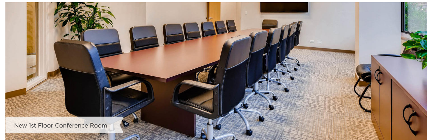
New 1st Floor Conference Room

For over 26 years, Granite Properties' top priority has been creating exceptional work environments across the United States so our customers can flourish. 143 Union is managed by Granite's own dedicated property operations team, a group of experienced professionals who keep customers' interests in the forefront of everything they do. Our on-site team offers responsive service along with a variety of Together We Connect programs and events to build a sense of community within your business home. The way we see it, getting to know our neighbors and customers not only foster opportunities, it enhances lives.