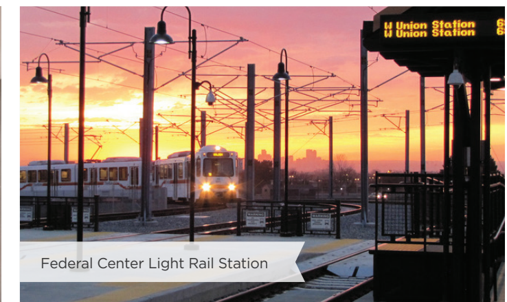
Federal Center Light Rail Station