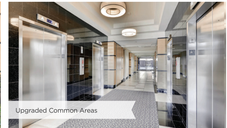
Upgraded Common Areas