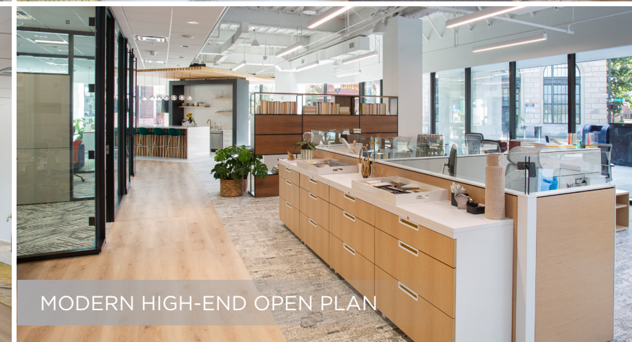
MODERN HIGH-END OPEN PLAN