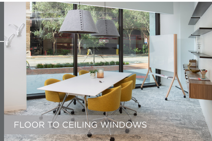
FLOOR TO CEILING WINDOWS