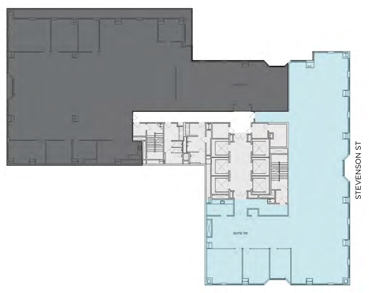
NEW MONTGOMERY ST