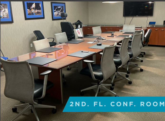
2ND. FL. CONF. ROOM