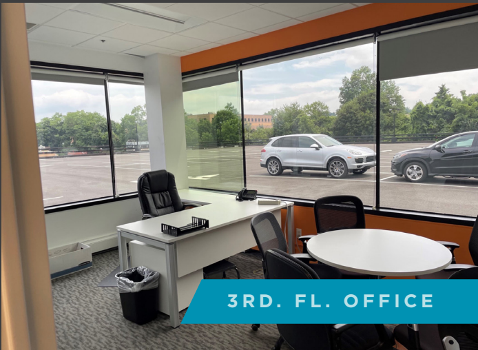
3RD. FL. OFFICE