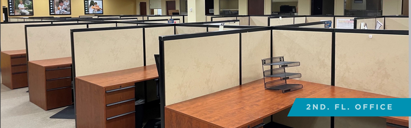
2ND. FL. OFFICE

Driven By a Passion to Exceed Customer Satisfaction