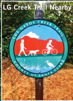
LG Creek Trail Nearby