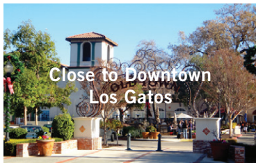
Close to Downtown Los Gatos