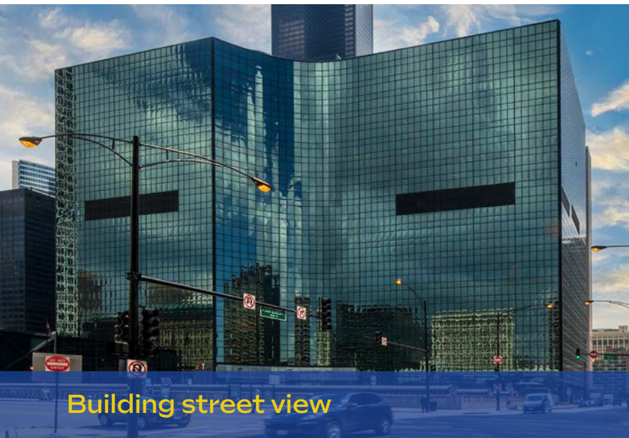
Building street view