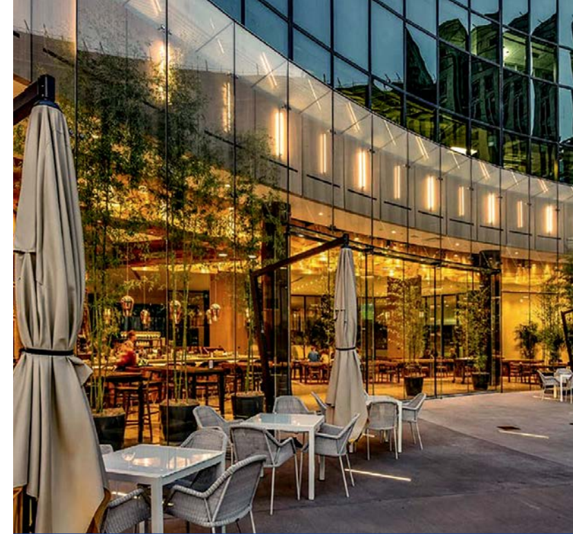
Restaurant, patio and garden