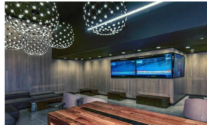
Common area - WiFi lounge