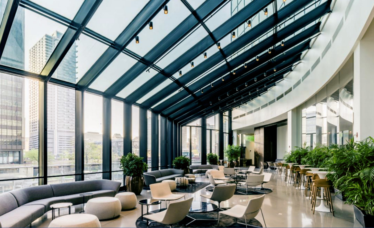
Common area - Atrium