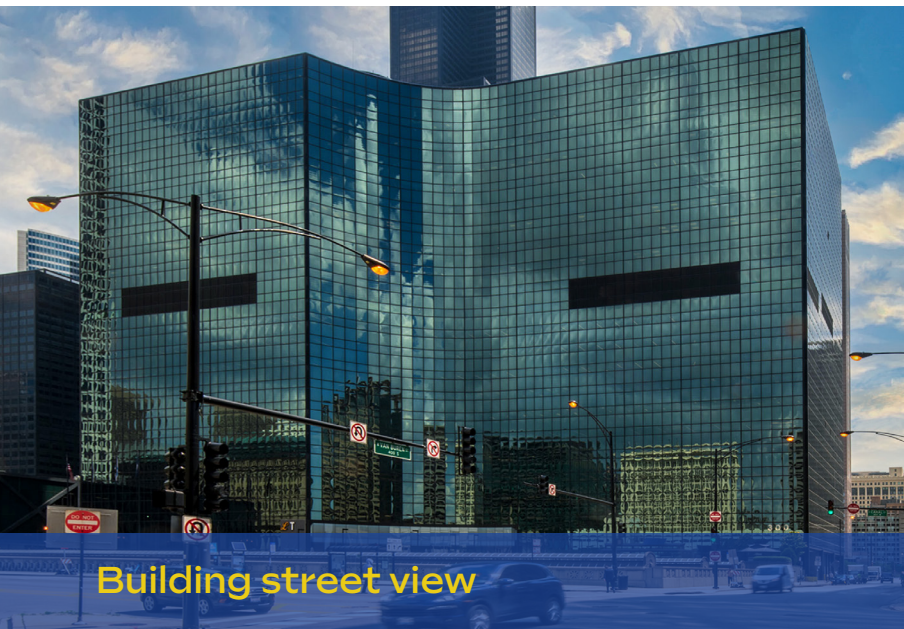
Building street view