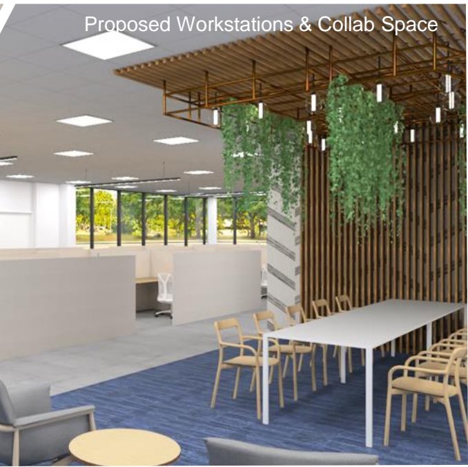
Proposed Workstations & Collab Space