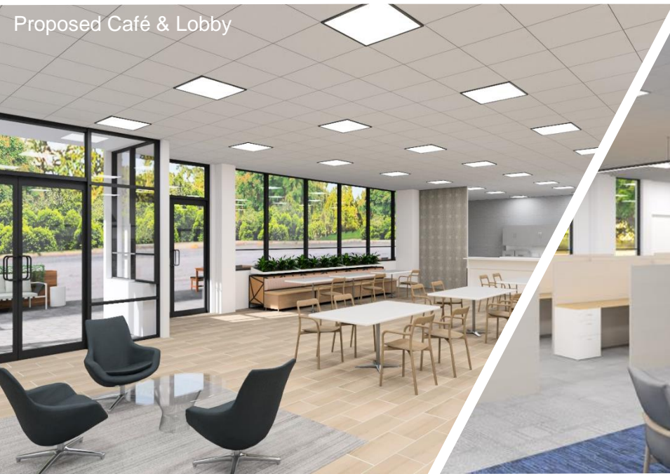
Proposed Café & Lobby