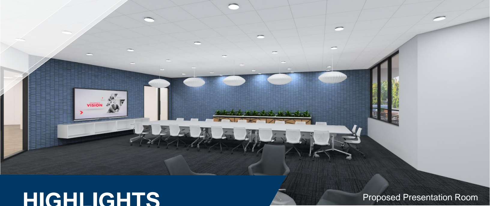
Proposed Presentation Room