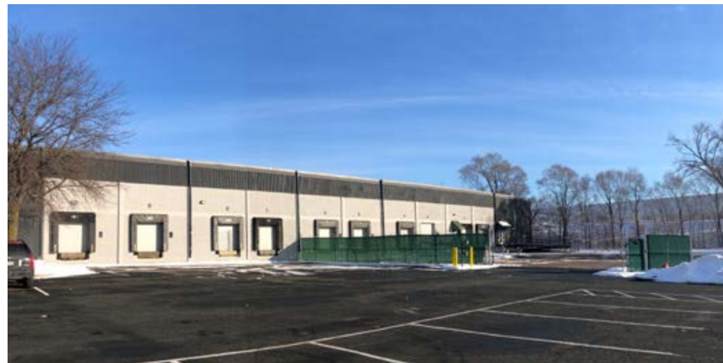
Hampshire Distribution Center North // 10801 Hampshire Ave S, Bloomington, MN