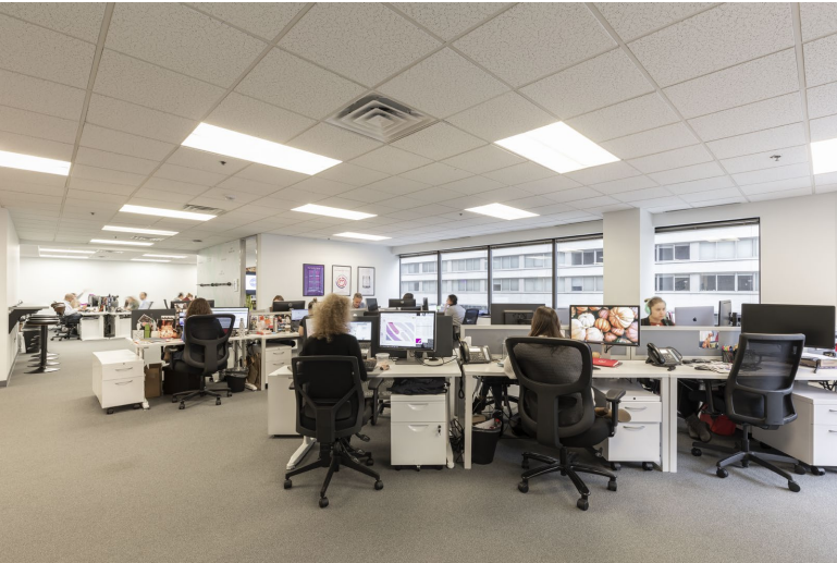
➤ Agile Layout & Design