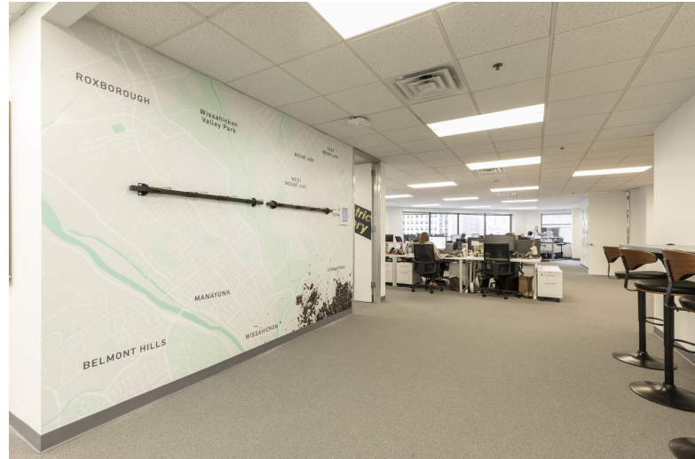
➤ Bar Top Working Stations