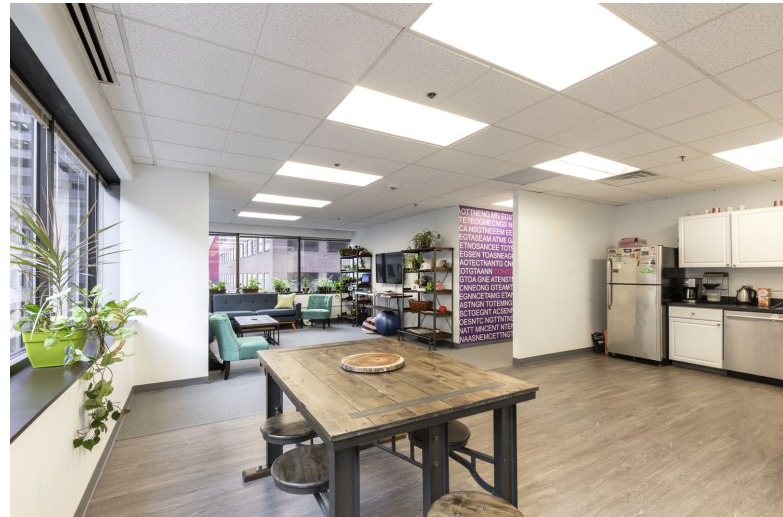
➤ Café & Lounge Area