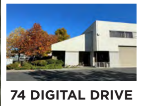
74 DIGITAL DRIVE