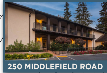
250 MIDDLEFIELD ROAD