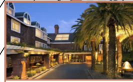
THE STANFORD PARK HOTEL