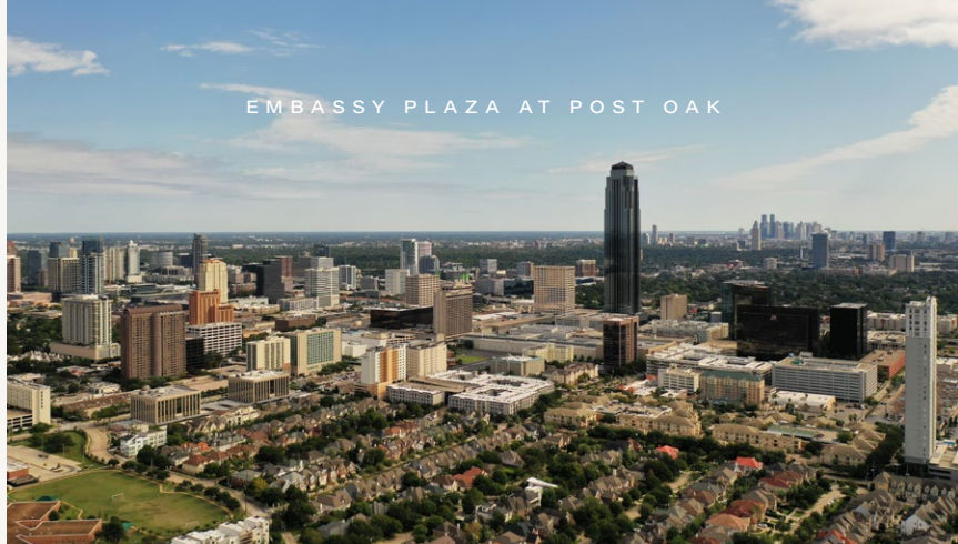
EMBASSY PLAZA AT POST OAK